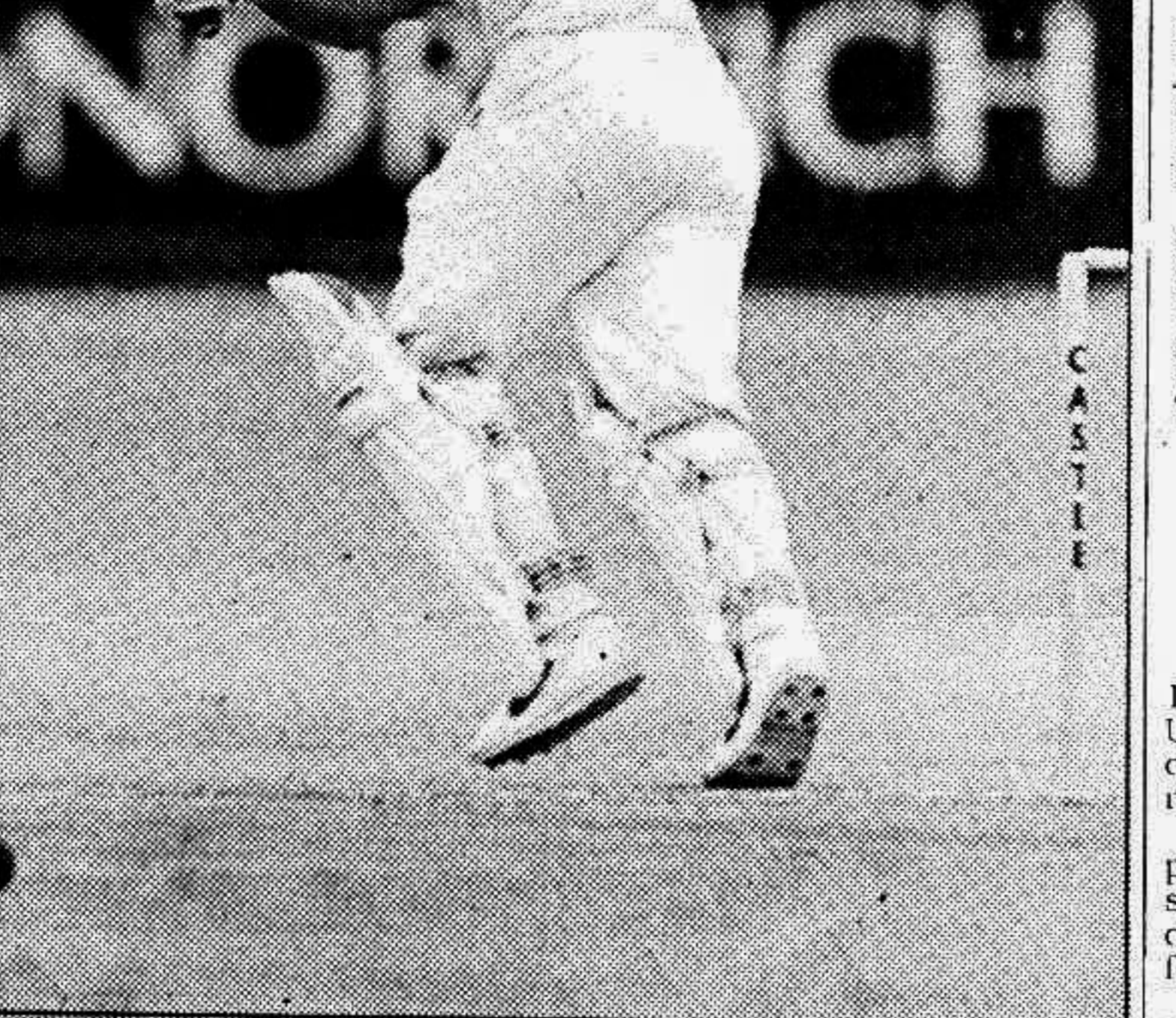
South Africa's Darryl Cullinan flicks the ball during his Test-best innings of 168 on the second day in Cape Town on January 3.

South Africa's Darryl Cullinan flicks the ball during his Test-best innings of 168 on the second day in Cape Town on January 3.