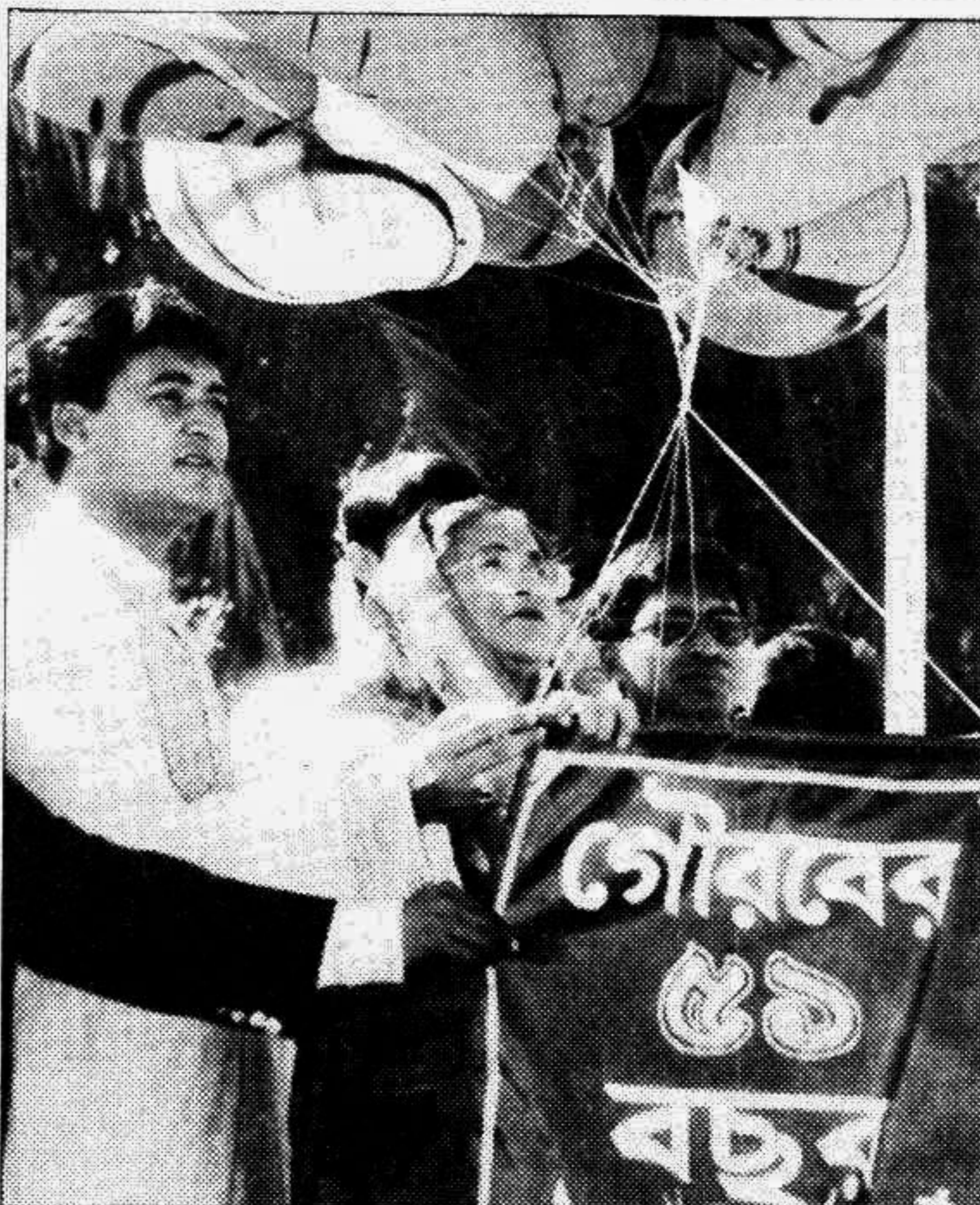
BCL turns 51 Prime Minister and Awami League chief Sheikh Hasina releases balloons at a function marking the 51st founding anniversary of Bangladesh Chhatra League at Paltan Maidan in the city yesterday.

He also read out to his Cabinet colleagues a recent World Bank observation which said that the effect of flood in Bangladesh's economy was 'temporary' and that the country's medium-term prospects were better than many others.