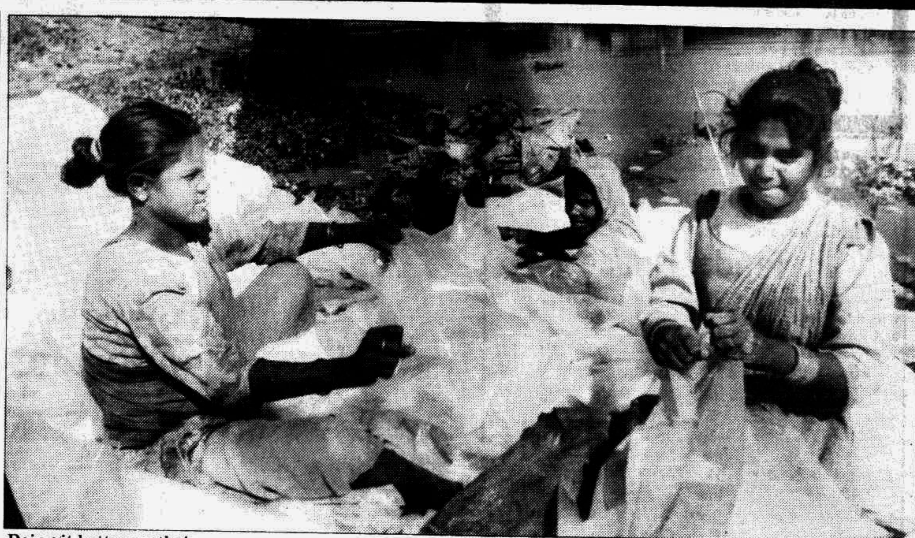
Doing it better on their own

Khaleda Zia's government brought 19 cases of corruption and misuse of power during his