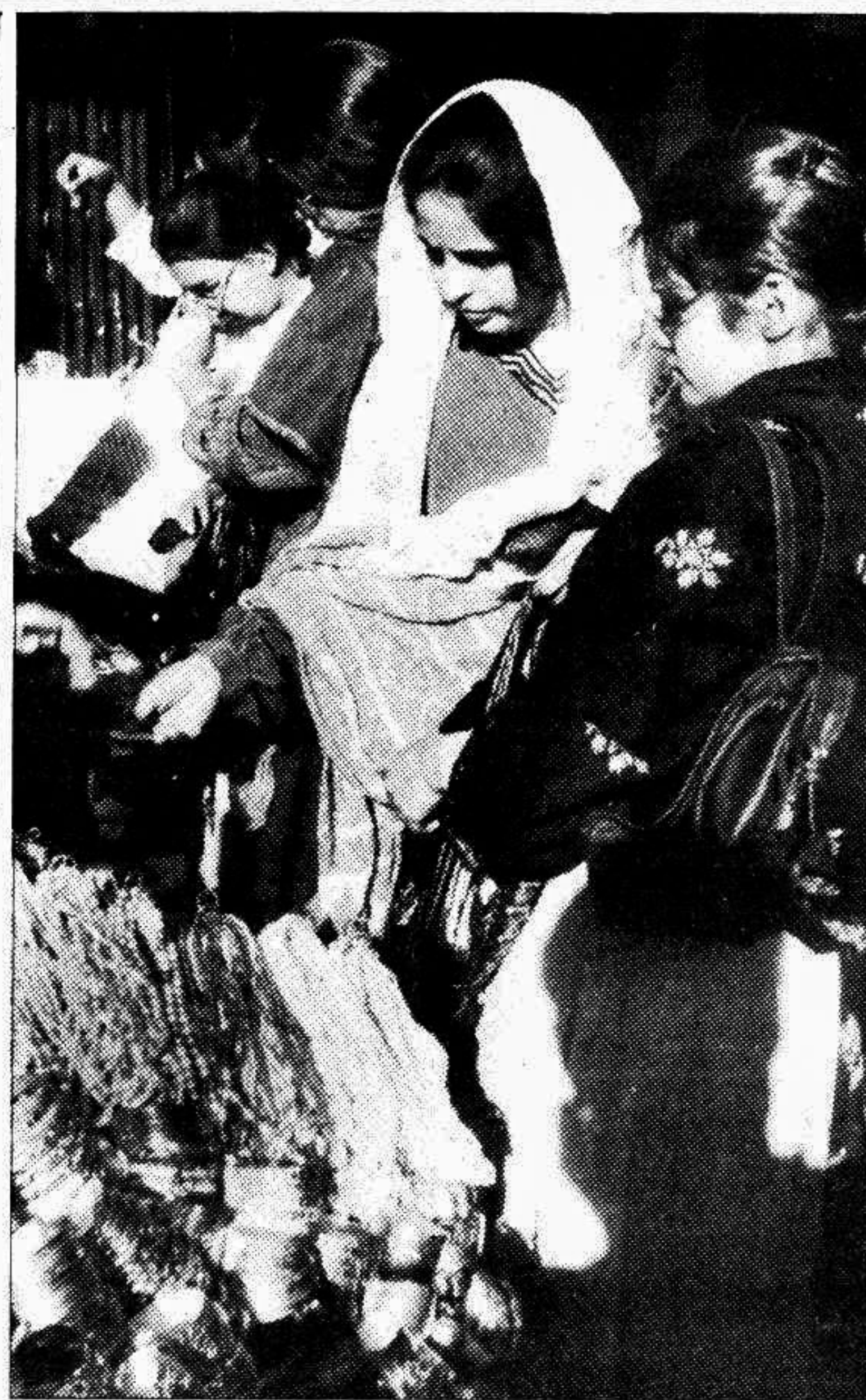
Gausia gets going as ever

Earlier, the prime minister unveiled the plaque of the extended inland container depot.