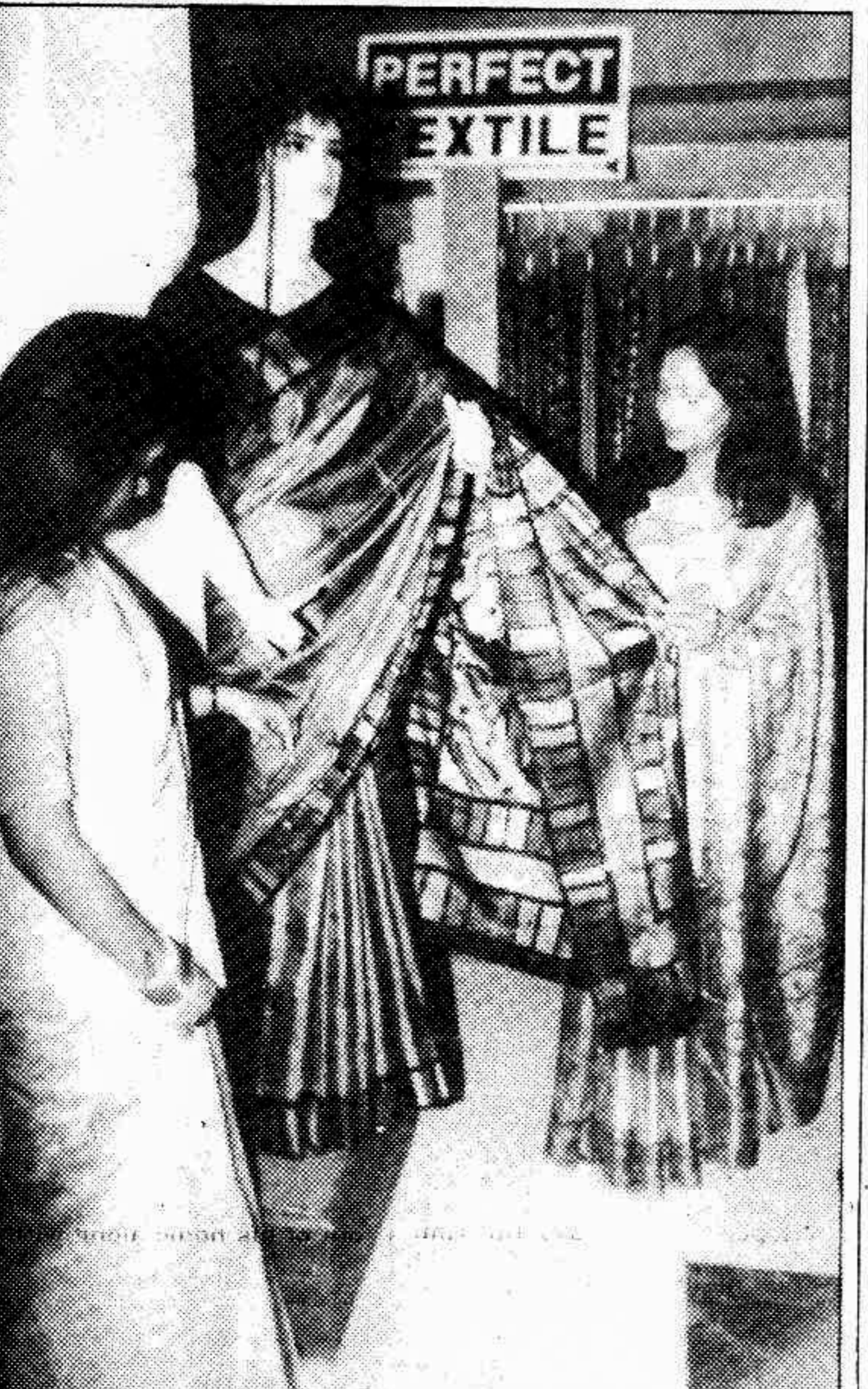
Perfect Textiles opened a new sales centre and showroom of its products at Mamta Plaza in Dhanmondi yesterday. The textiles displayed its special Eid collection of sarees at the centre.