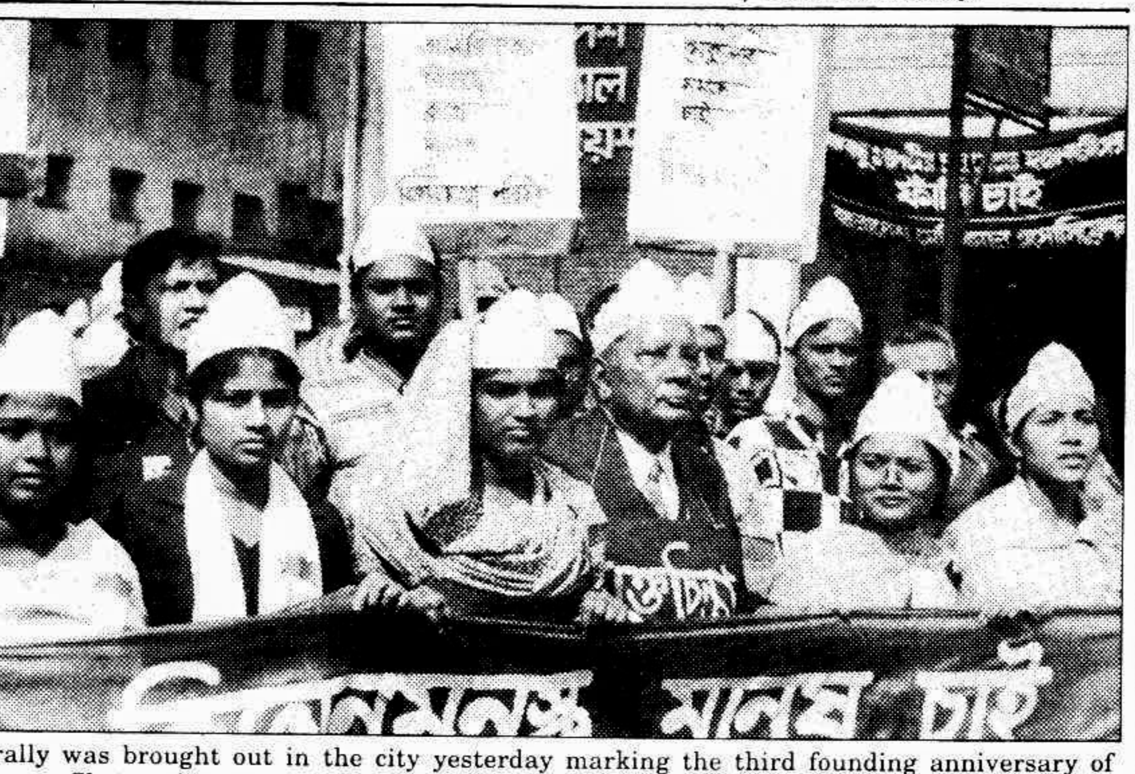
A rally was brought out in the city yesterday marking the third founding anniversary of 'Biggan Chetona.'

Police raided a microbus at 12 noon and found the contraband. They arrested the three youths travelling in the microbus who were identified as Alamgir and Mujibur of Chhapainabagan and Mohsin of Shariatpur district.