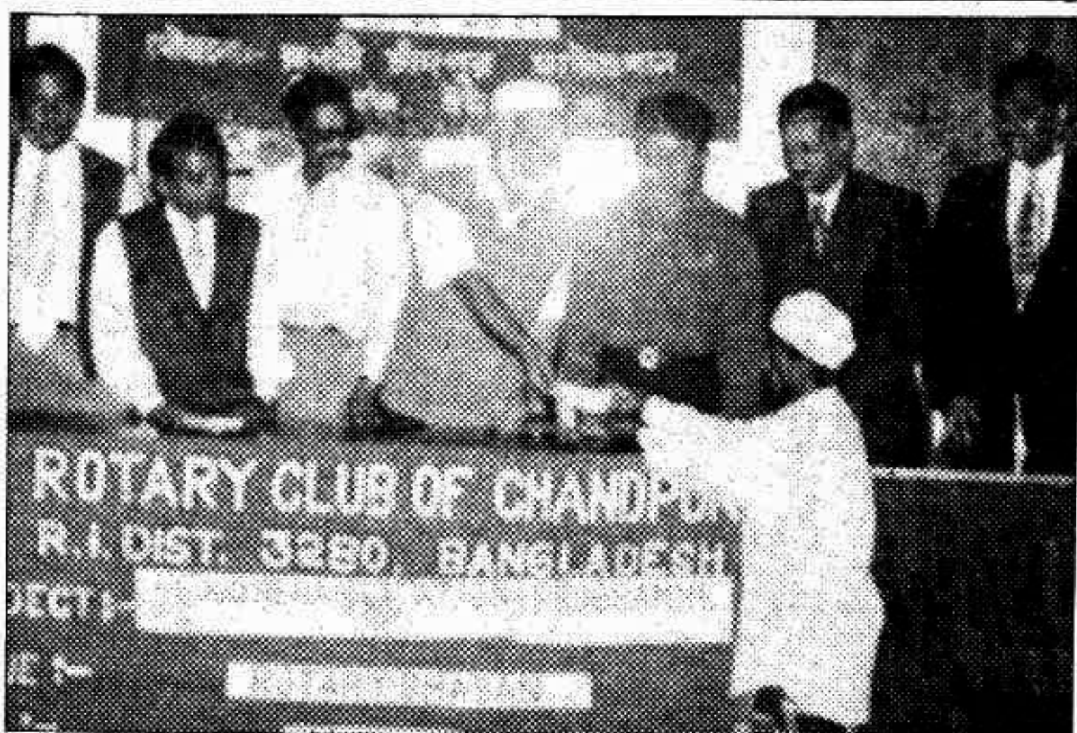
CHANDPUR: Chandpur Rotary Club in cooperation with Rupashi Chandpur Foundation of USA distributing cheques among the flood affected poor people at village Kallanpur. The programme is part of the flood rehabilitation programme.