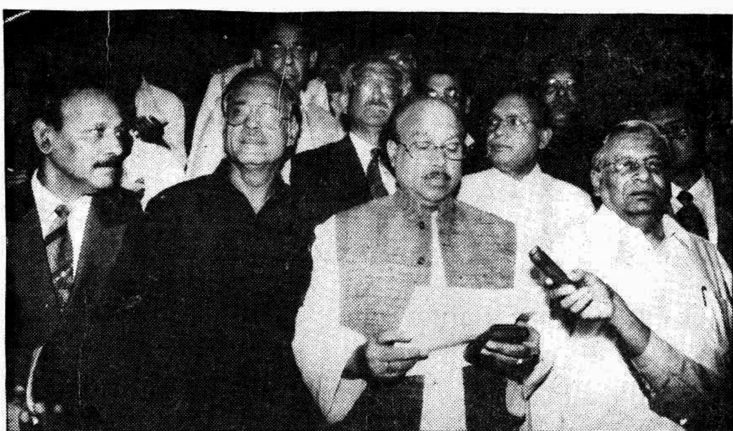
DIAL P FOR PARLIAMENT: Looks good when it works

Oct 2: The United Nations General Assembly (UNGA) urges international community to respond urgently to assist Bangladesh in its efforts to overcome the destruction caused by the recent floods. Oct 8: Prime Minister Sheikh Hasina declares that trial of all killings, including former president Ziaur Rahman, Major General Monjur and Colonel Taher will be held in the country. Oct 13: Bangladesh retains the ACC trophy with a thumping eight-wicket win over underdogs Malaysia in the final. Oct 15: Twenty-three persons including the then president Khandaker Mushtaque Ahmed, are charge-sheeted by the CID in the jail killing case. Oct 19: The government imposes new taxes and surcharges on a number of items and services with immediate effect to raise more funds for post-flood rehabilitation. Oct 24: Prime Minister Sheikh Hasina formally opens the Wills International Cup cricket tournament at the Bangabandhu National Stadium.