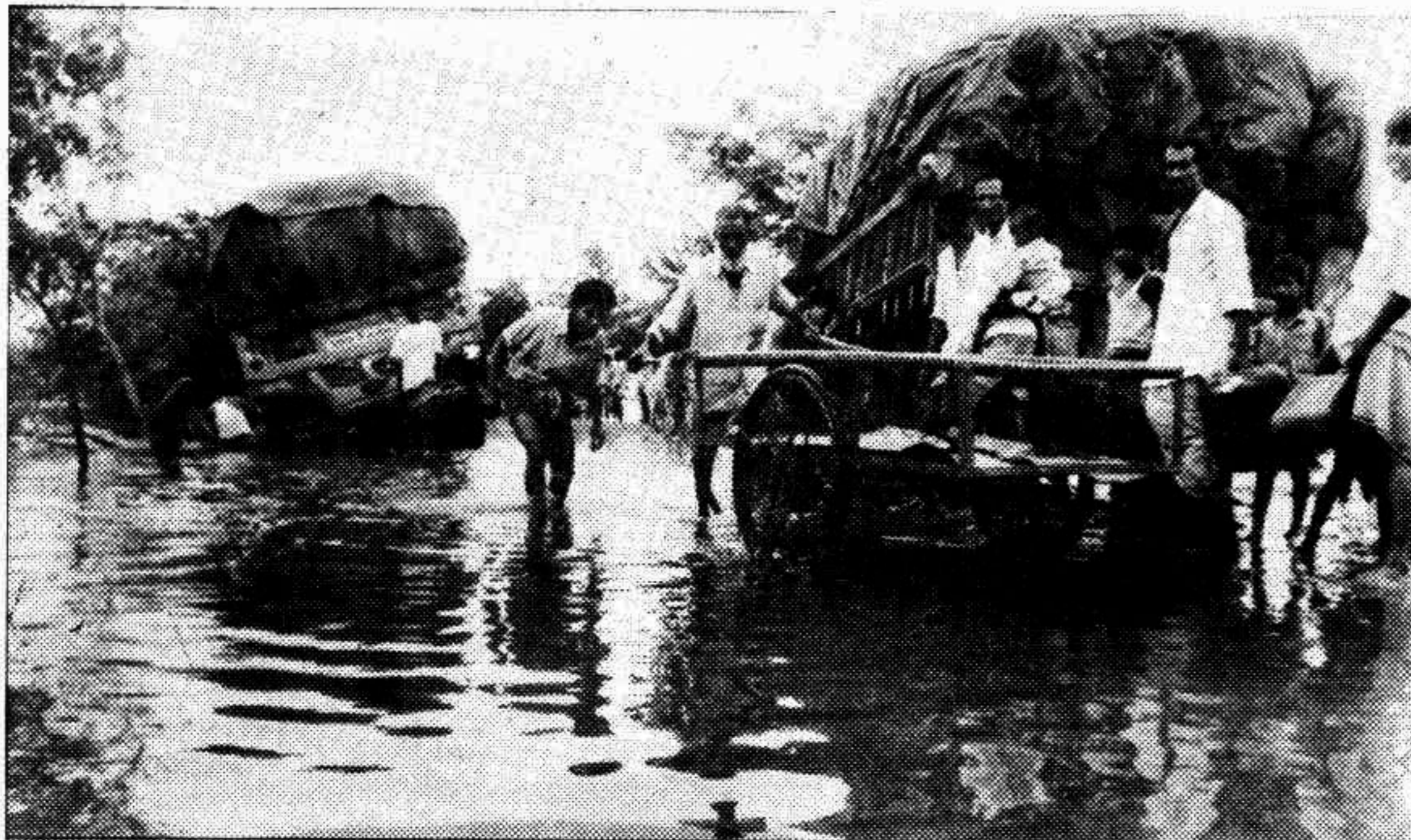
FIGHT AGAINST A FAMILIAR FOE: Working the way through all-consuming flow

Apr 1: Drive to check pilferage cut system-loss. Army deployed