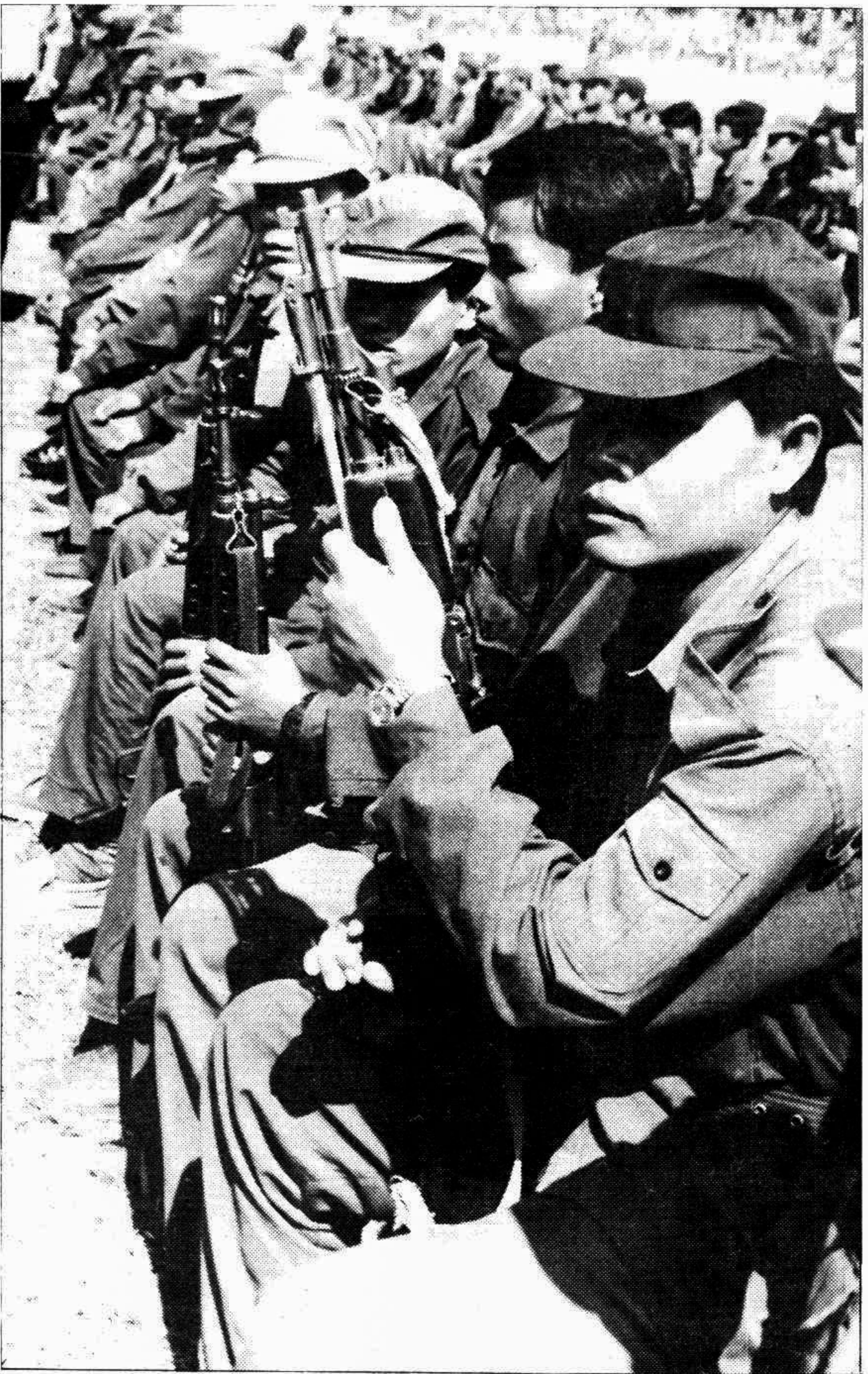
ARMS DOWN: Peace in Chittagong Hill Tracts