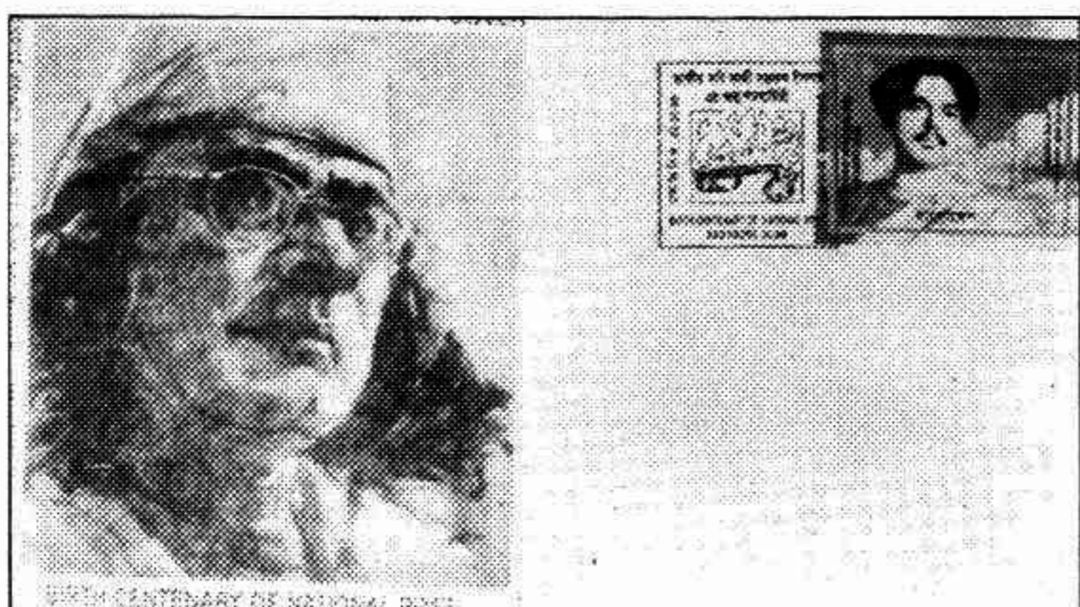
A first day cover and commemorative postage stamp released yesterday on the occasion of birth centenary of National Poet Kazi Nazrul Islam.