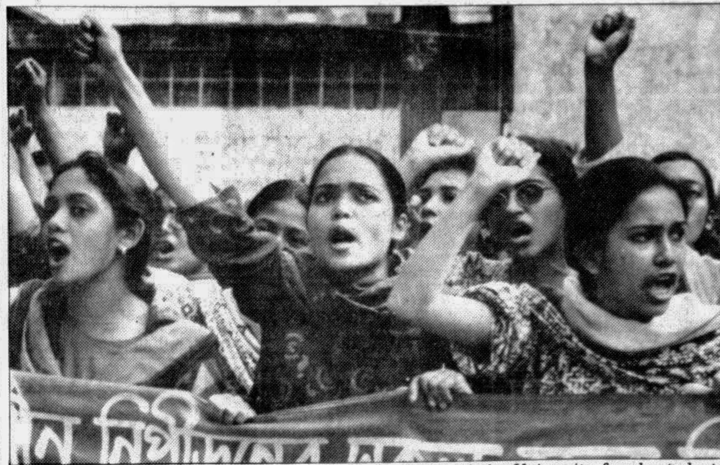
Refusing to be silenced by successive attacks by rivals, Dhaka University female students have continued their protest against alleged sexual assault by teachers. With renewed resolve, they chanted demand yesterday that the 'culprits' be brought to book.

Iraq says 42 soldiers and more than 40 civilians were killed in the strikes, Iraq alleges that many civilian targets were hit, and not just defense sites as the United States maintains.