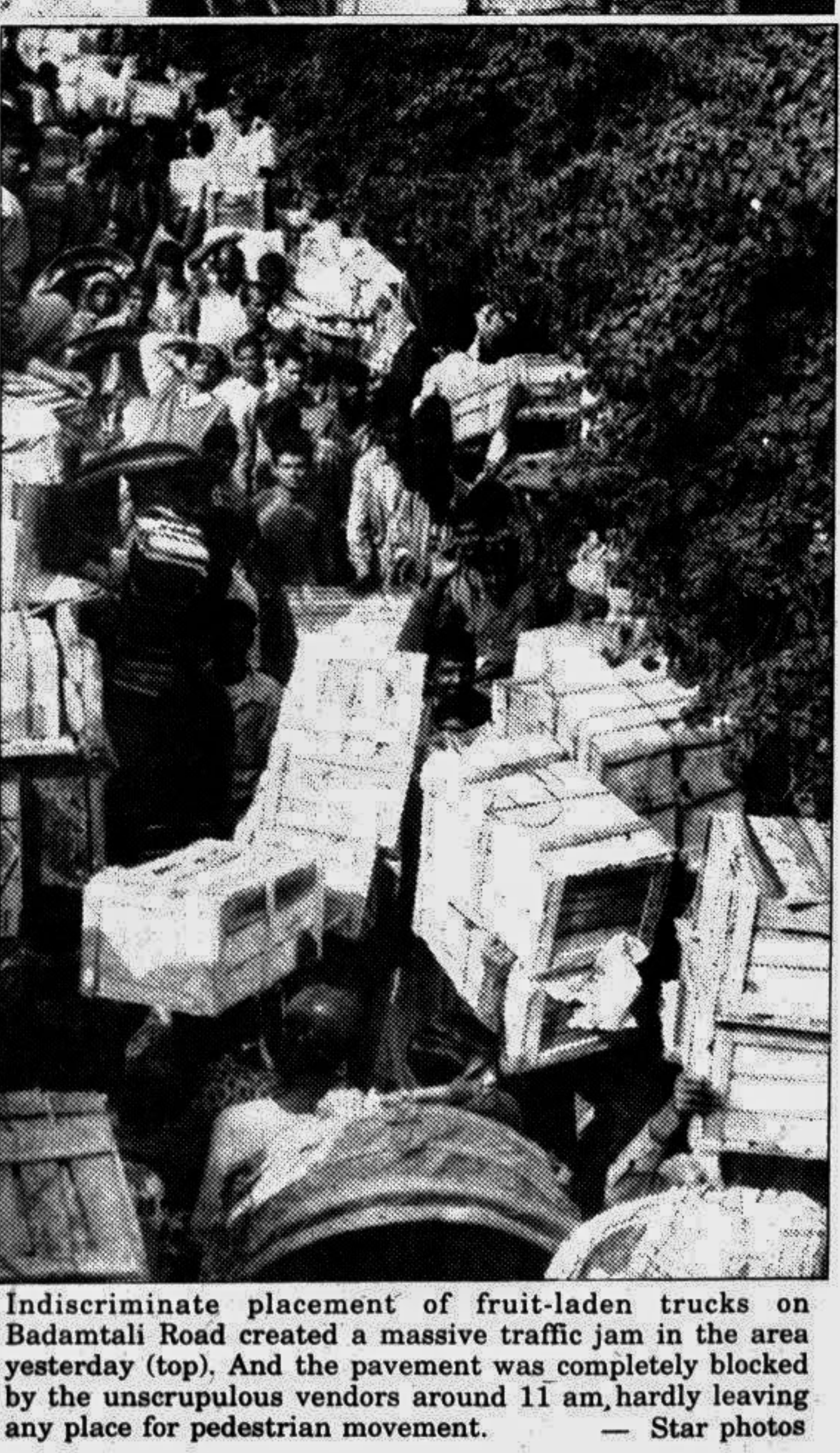
Indiscriminate placement of fruit-laden trucks on Badamtali Road created a massive traffic jam in the area yesterday (top). And the pavement was completely blocked by the unscrupulous vendors around 11 am, hardly leaving any place for pedestrian movement.