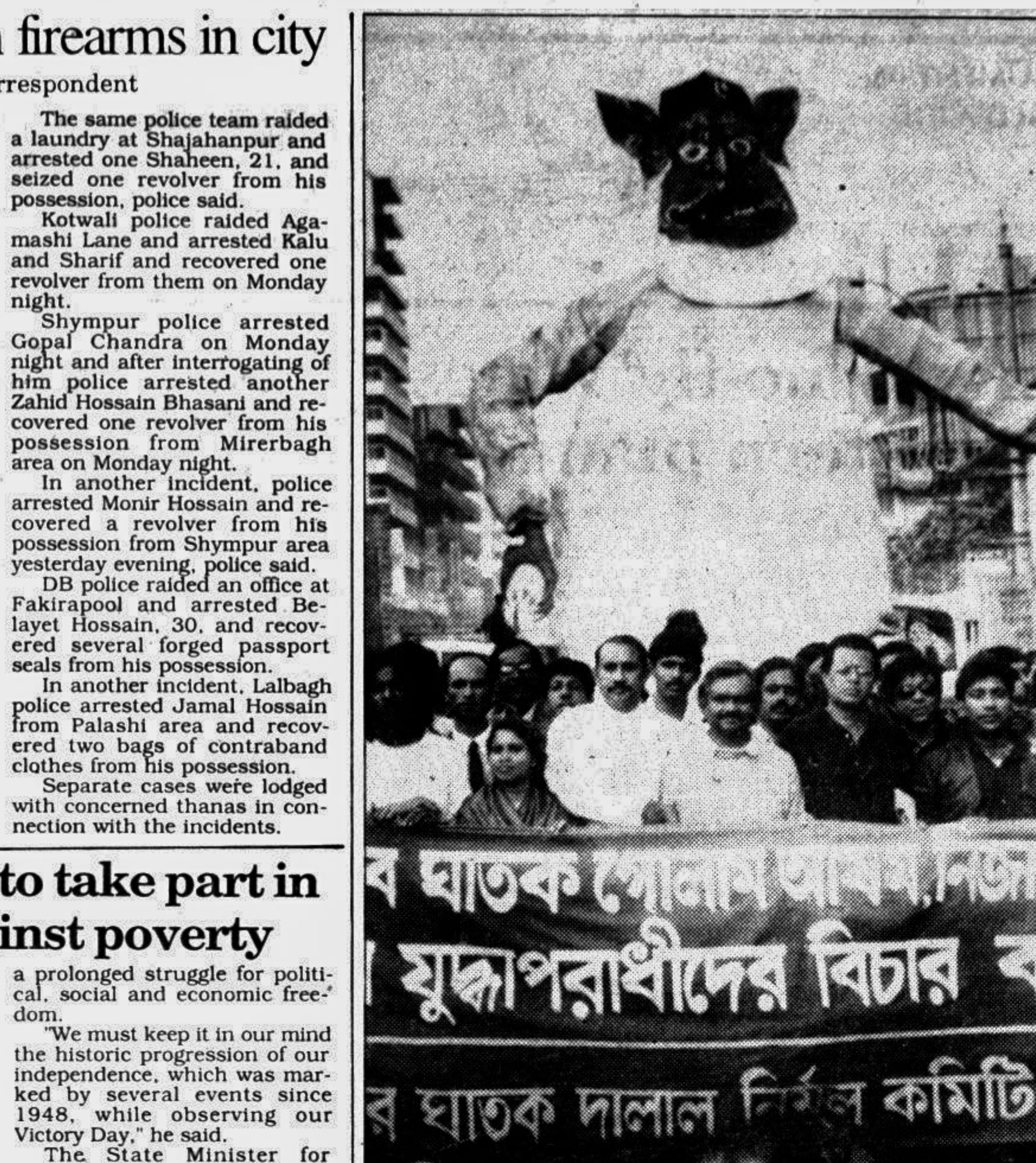
Ekatturer Ghatak Dalal Nirmul Committee and Muktiyoddha Sangsad Kendriya Samannaya Parishad jointly carrying an effigy of Golam Azam in a procession in the city yesterday to mark the 'National Hatred Day.' Later, they burnt down the effigy.