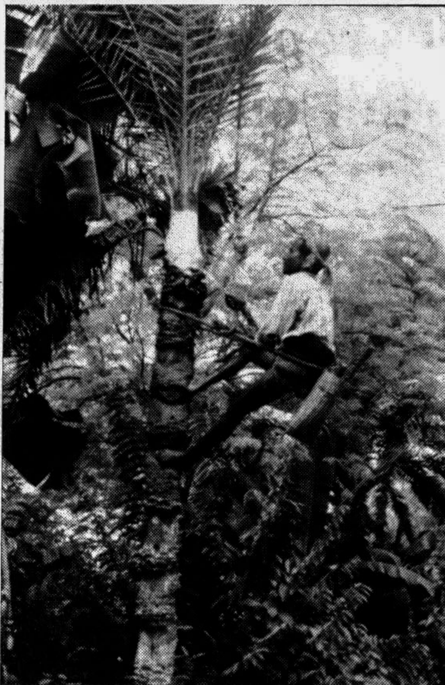
JHENIDAH: A 'gachi' engaged in cutting a date tree at village Gobindapur in Jhenidah municipal area.

Of the recovered timber, 4,000 cft were recovered from Paklakhali range while 600 cft from Shishak, 5,000 cft from Baghalahat, 2,000 cft from Narachhara, 700 cft from sadar and 1,000 cft from Kachalung Zuhk ranges. Apart from this, the Forest Department also seized a truck, a jeep and 25 boats and filed 110 forest cases with the Rangamati court.