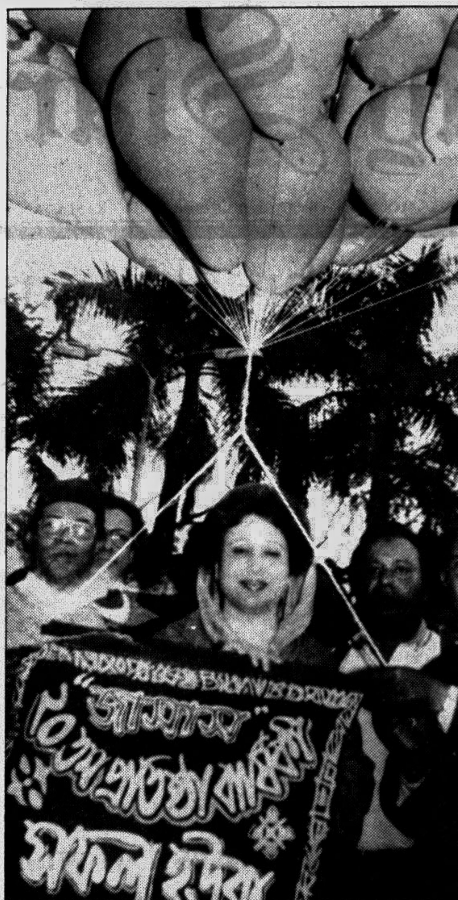
BNP chairperson Begum Khaleida Zia inaugurating the 20th founding anniversary programme of Jatiyatabadi Samajik Sangskritik Sangstha. (Jasas) at Ramna Batamul in the city yesterday.

Executive Engineer (RHD) Road Division, Nilphamari.