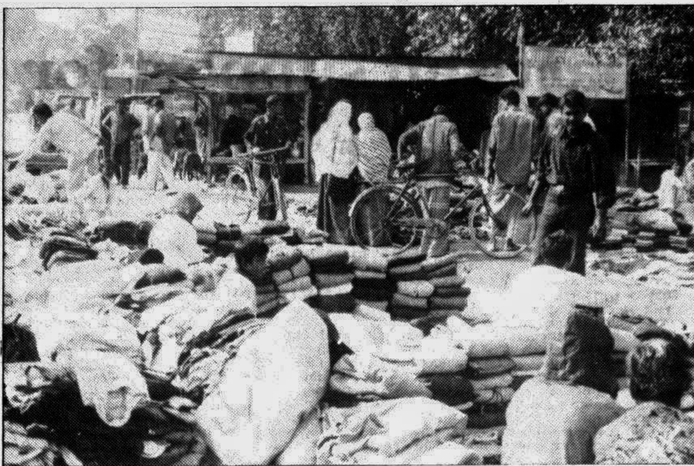
JHENIDAH: Businessmen of old clothes doing a brisk business during the ongoing winter season in the district town. Photo shows some small traders waiting for customers with warm clothes on a foot-path of the town.

A total of 50 cattle died and more than 500 were attacked with the disease, locally known as 'Khura', during the last one month. The badly affected thanas are Atpara, Madan, Mo-hanganj and Kalmakanda. Local people said the cattle affected with the disease could not eat and move as the mouth and feet are infected with germs. It is alleged that local livestock department did not take adequate measures to prevent the 'Khura' disease. Moreover, acute scarcity of medicine and fodder is prevailing in the district.