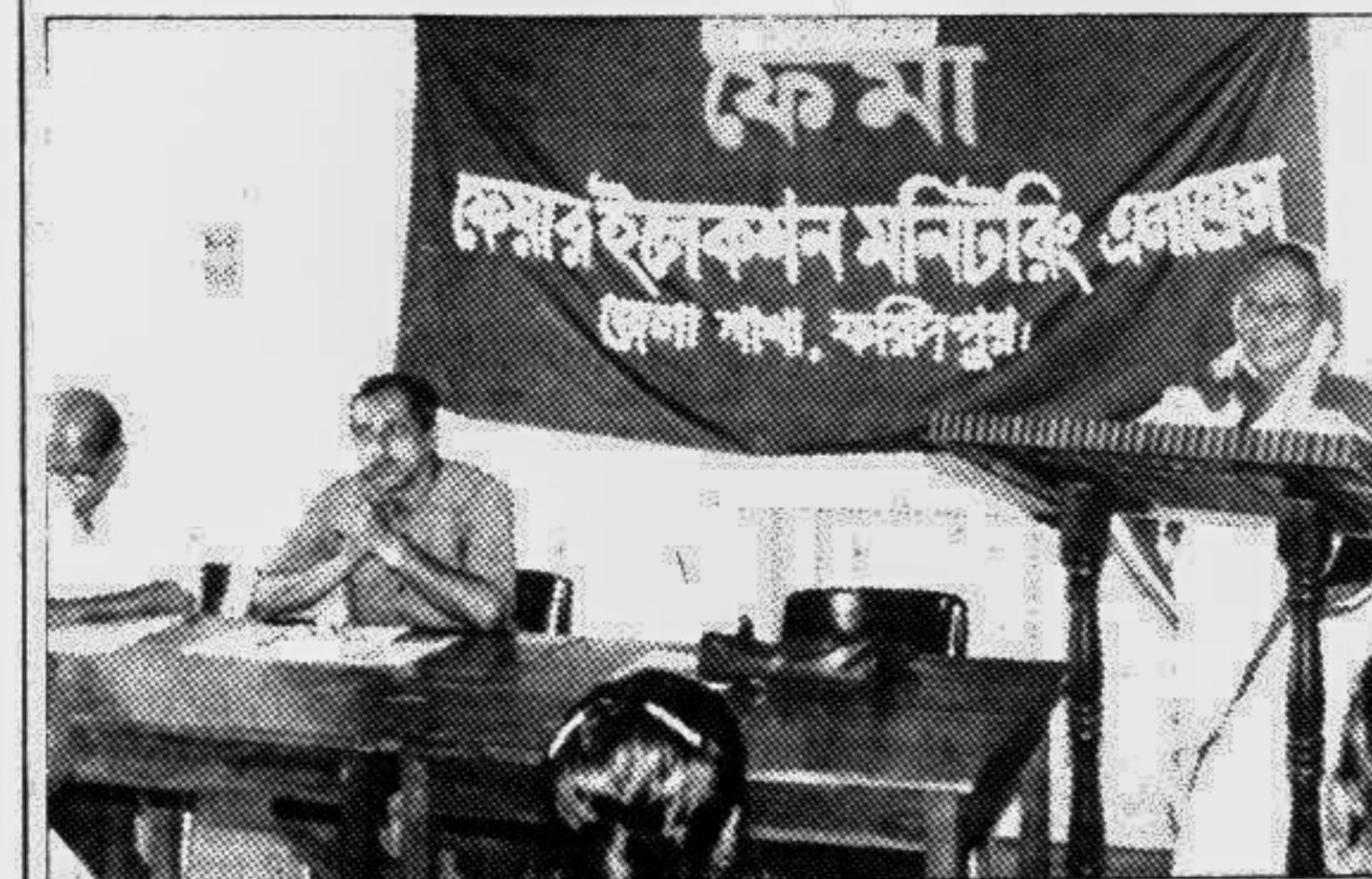
FARIDPUR: The third founding anniversary of Fair Election Monitoring Alliance (FEMA) was celebrated here recently.

People of the union recently staged a demonstration in protest against corruption by the chairman and demanded his removal. They also demanded immediate investigation.