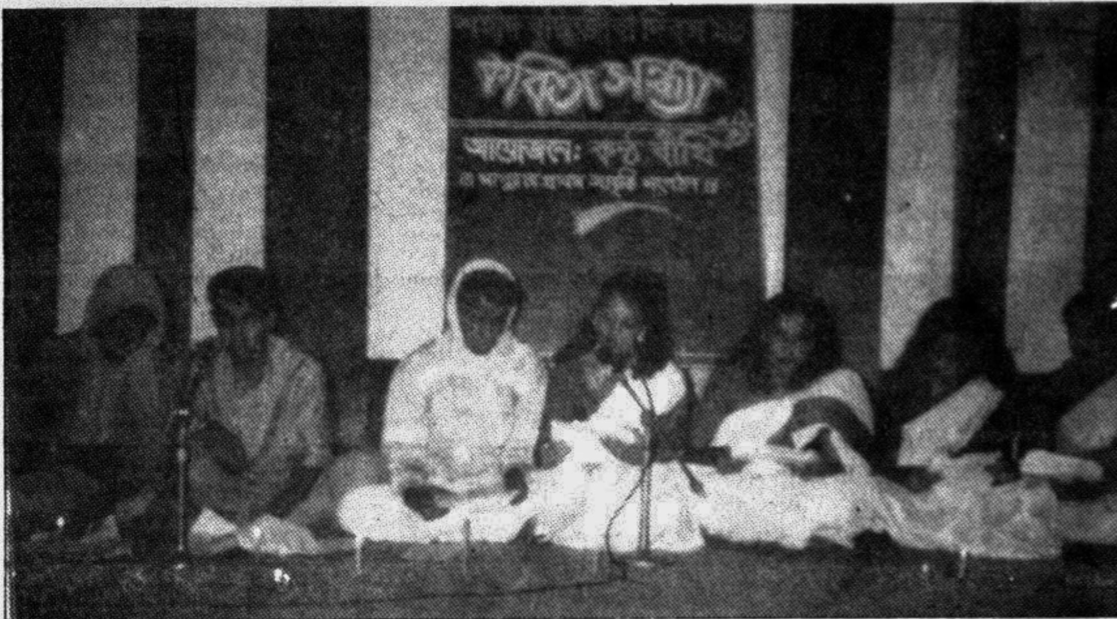
MAGURA: Martyred Intellectuals Day was observed here befittingly on December 14. On this occasion 'Kantho Bithi', the first recitation club in Magura town arranged a recital soiree in the Shaheed Minar premises of the local government college.

They urged the concerned authorities including BADC and AED to take urgent steps to ensure supply of improved wheat seeds to growers in proper time.