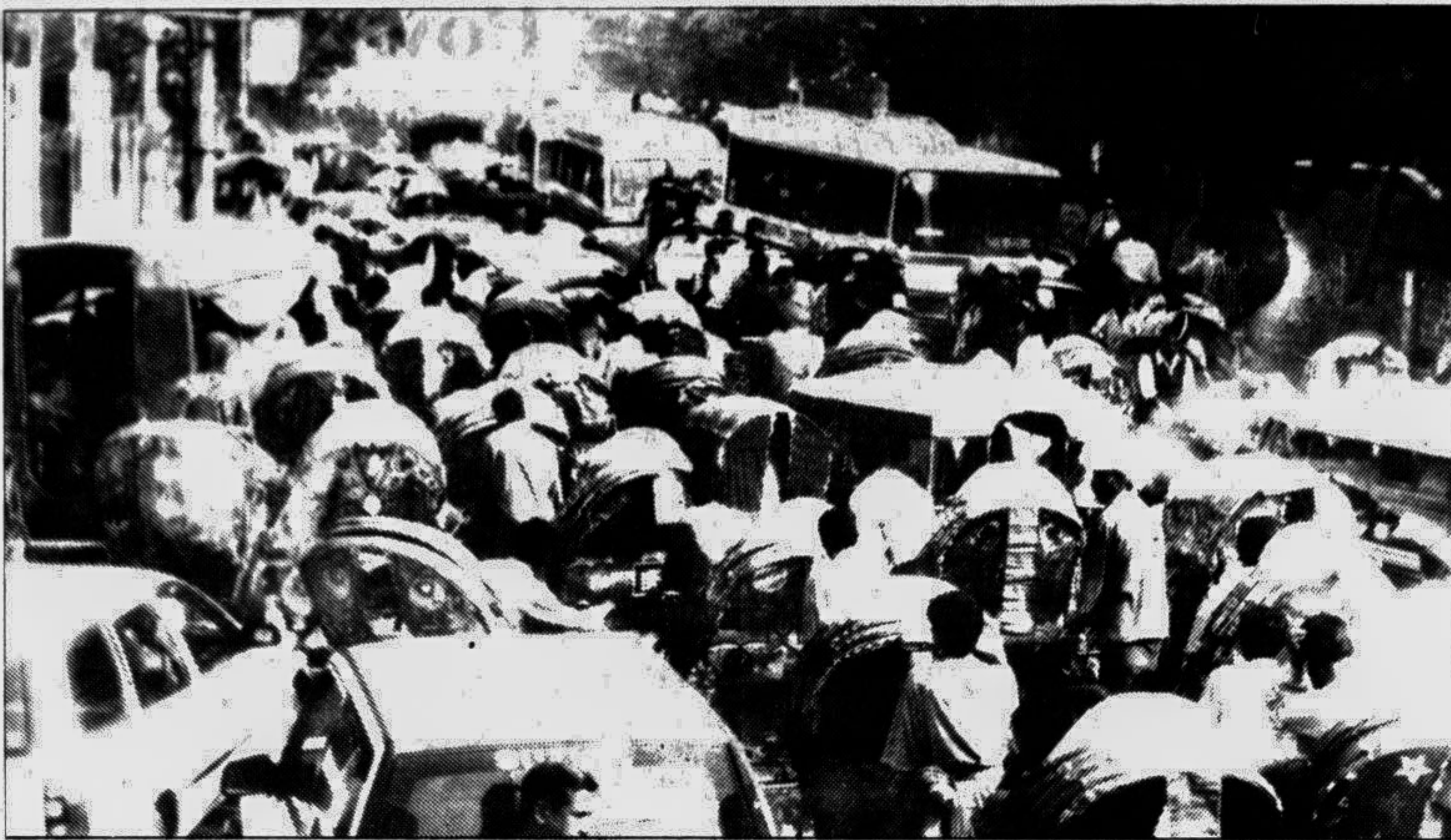
Traffic police totally lost control of the situation at Fulbaria in the city yesterday for indiscipline vehicular movement.

During his stay in Jakarta, Khan also attended a party hosted by BJ Habibie, Indonesia's President for the visiting journalists from around the world at the Presidential Palace.