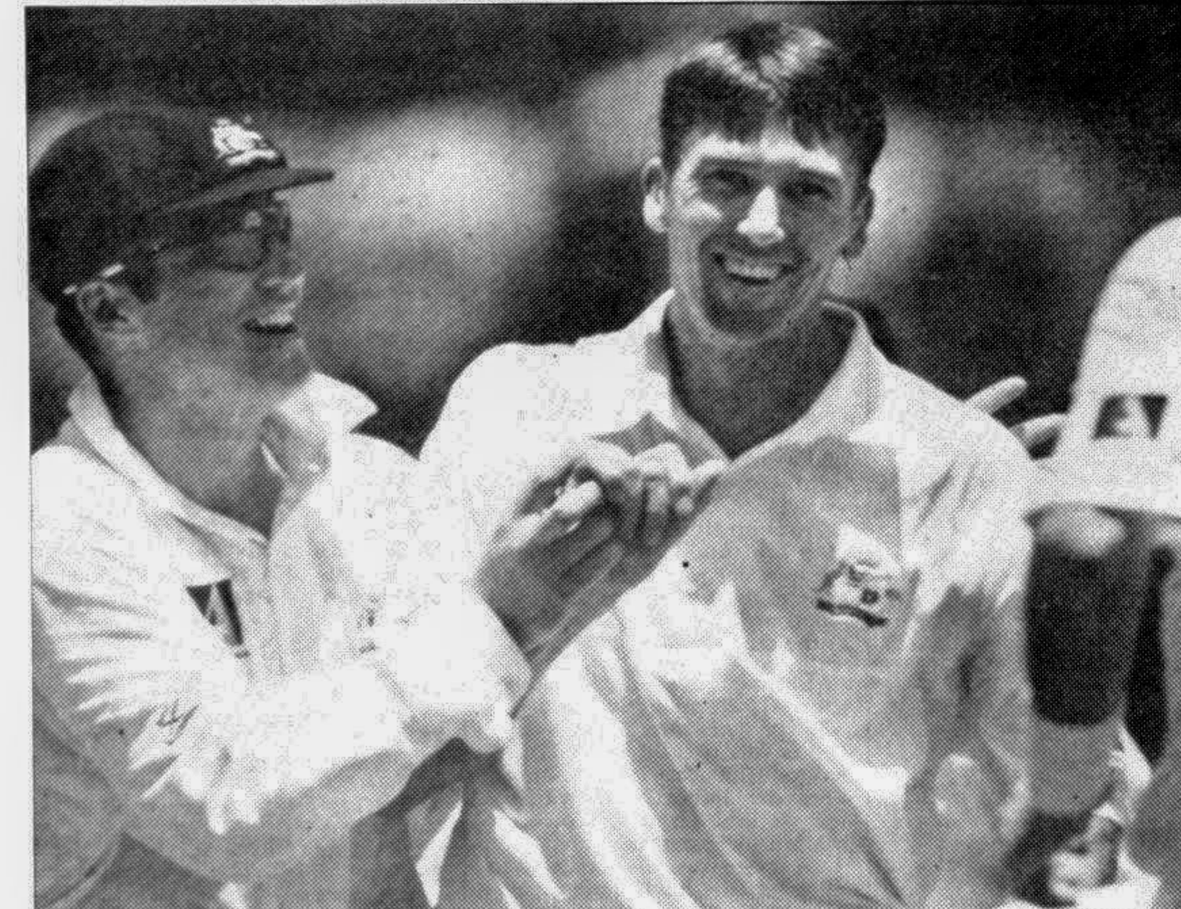
An AFP file photo shows Australian fast bowler Glenn McGrath (R) being congratulated by his captain Mark Taylor during the first Ashes Test last month. The strike bowler was cleared to play in the fourth Test which begins at the MCG today.

"If I'm standing out there one day thinking 'what the hell am I doing out here,' that will be the reason I stop playing."