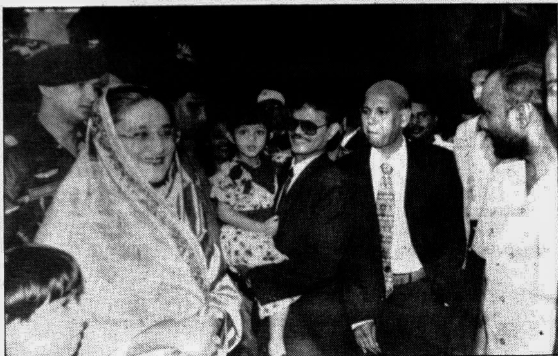
Prime Minister Sheikh Hasina exchanging greetings with members of the Christian community on the occasion of Christmas Day at Ganobhaban yesterday.