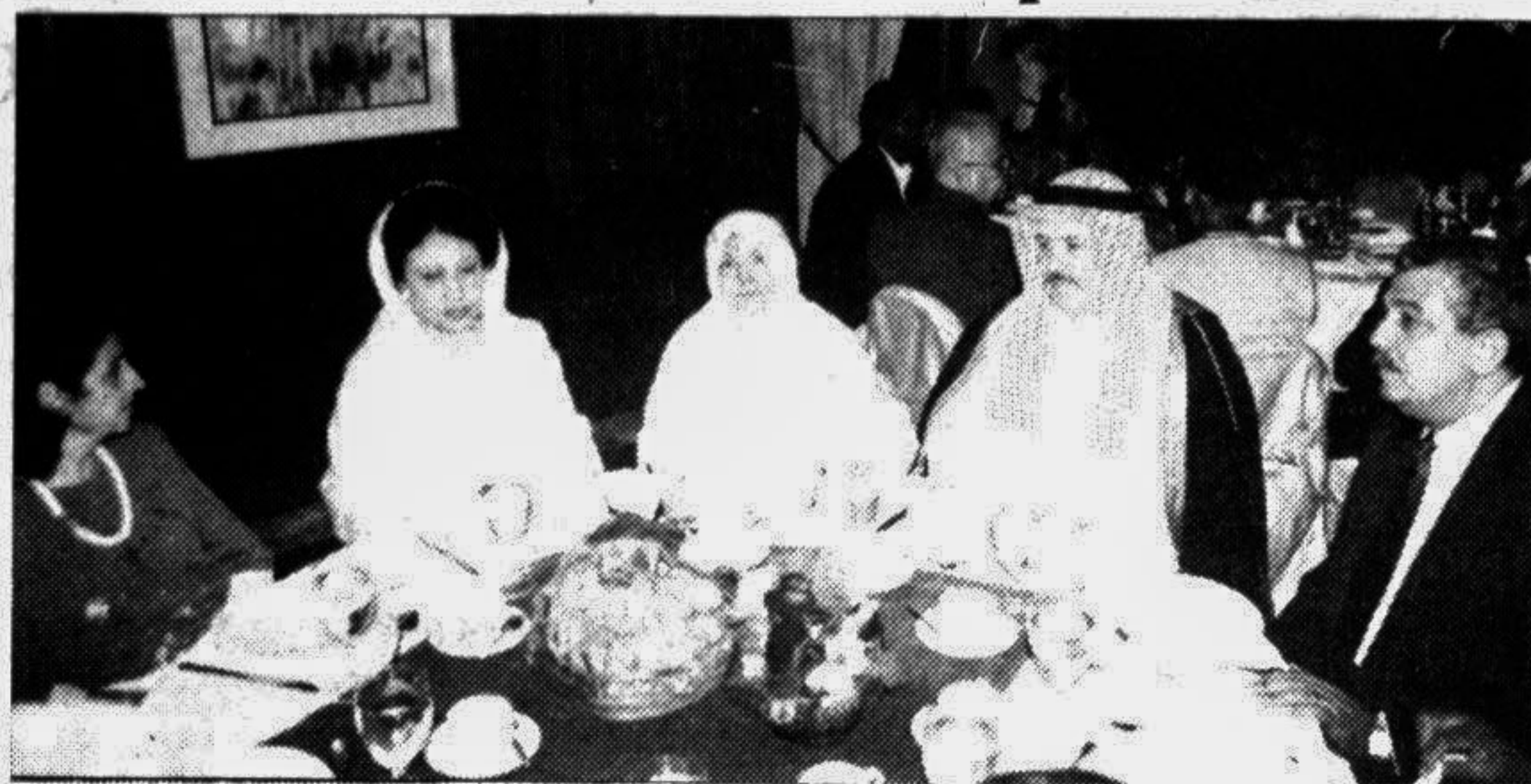
BNP chief and Leader of the Opposition in Parliament Begum Khaleda Zia hosted an iftar party in honour of foreign diplomats at her official residence at Minto Road yesterday.