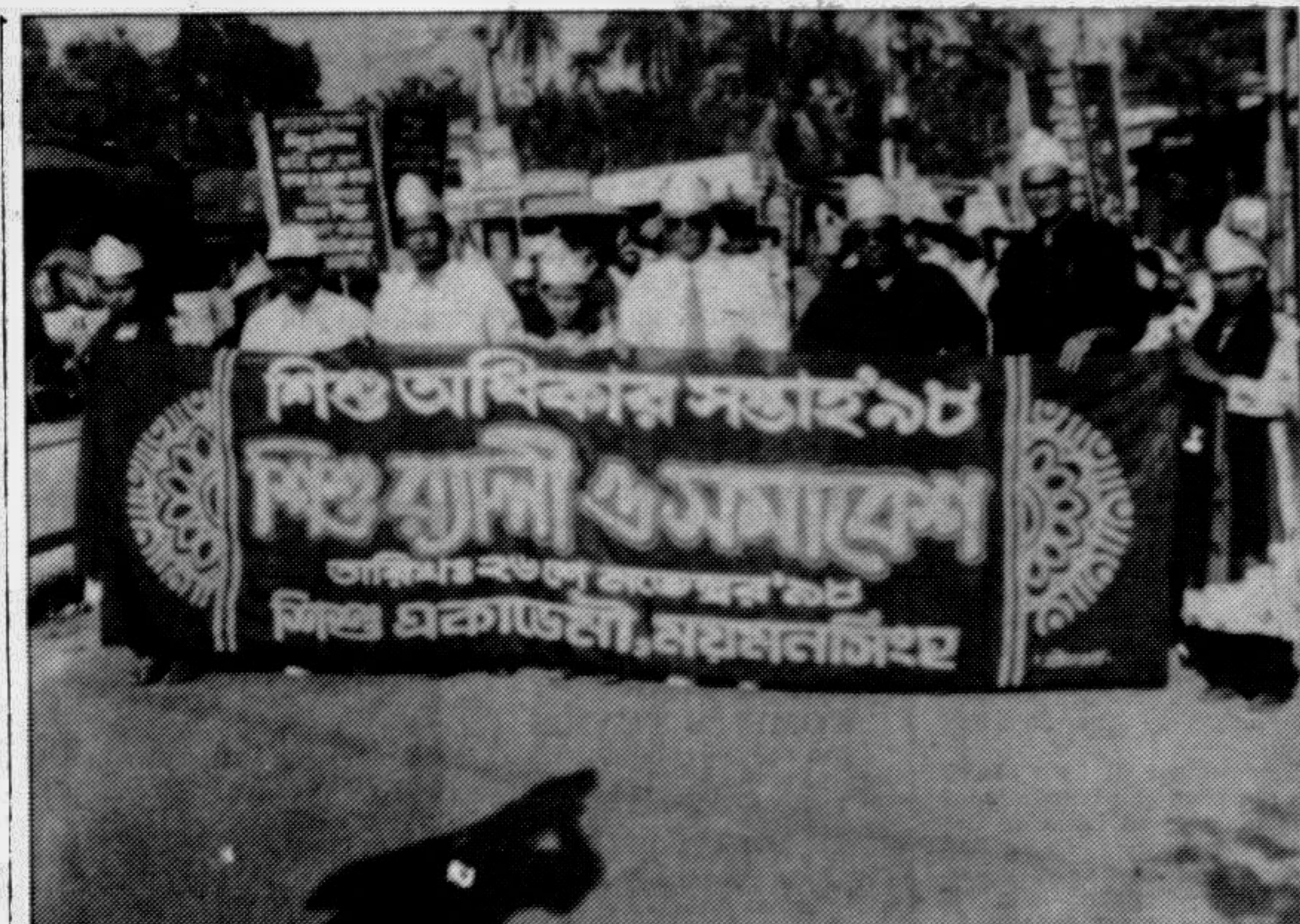
MYMENSINGH: A colourful procession was brought out in the town in observance of Child Rights Week '98 which was organised by Shishu Academy. The processionist paraded the main thoroughfares in the town.

On the fateful night, the highway dacoits created barricade across the road with three logs at the place of occurrence of the dacoity. Meanwhile, a Bagra bound truck reached the spot. Then the miscreants committed the dacoity and fled away after beating the driver and the helpers. The dacoits also damaged the wind screen of the truck.