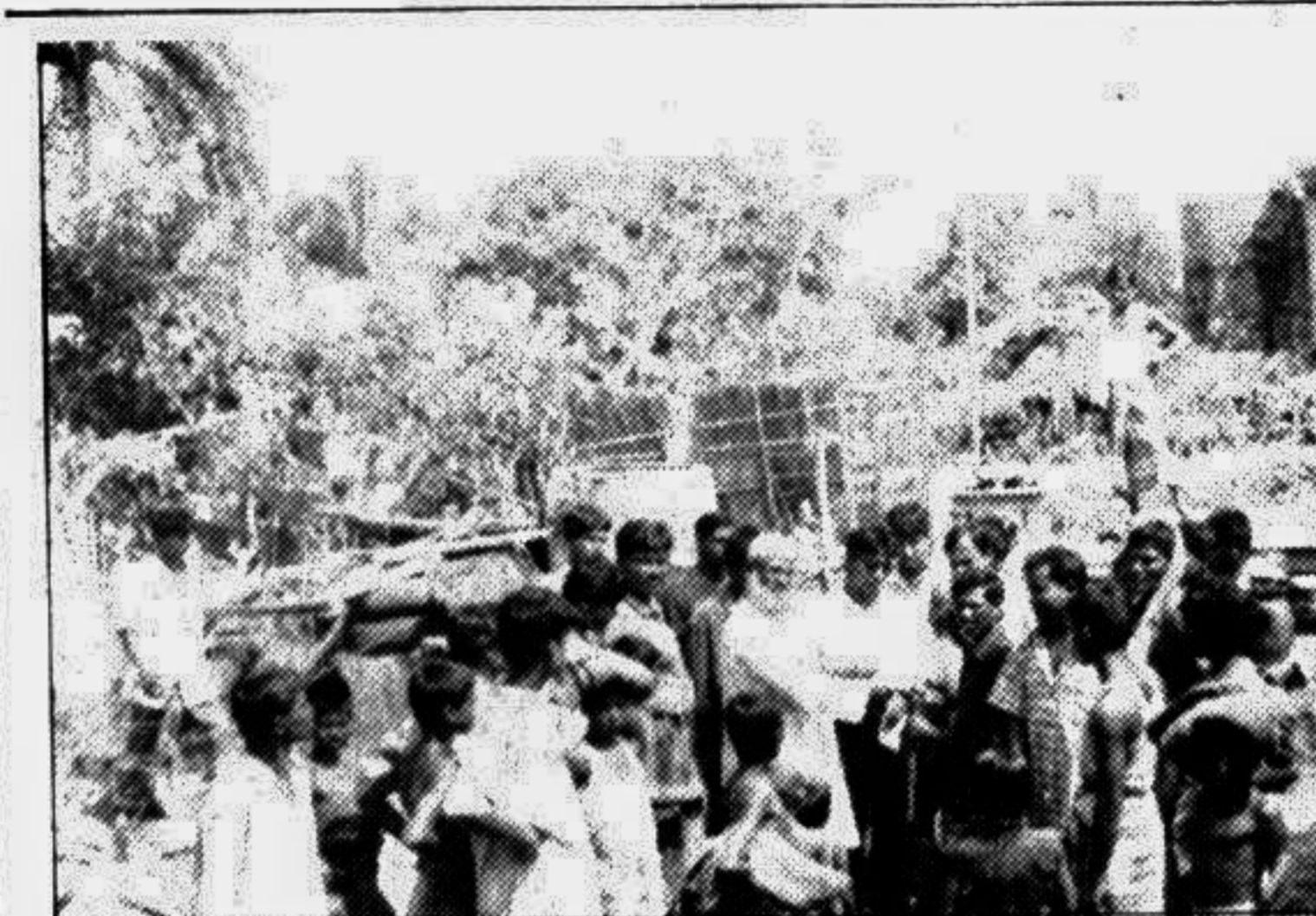
PABNA: Rafiqul Islam Bakul MP, distributing money among the tornado victims of Kshudra Matiabari village. A severe tornado lashed over the area a few months back.

The department has advised the growers to use pesticides 'Furadan' and 'Kaleskin' mixing with one litre water at the roots of the saplings on an experimental basis.