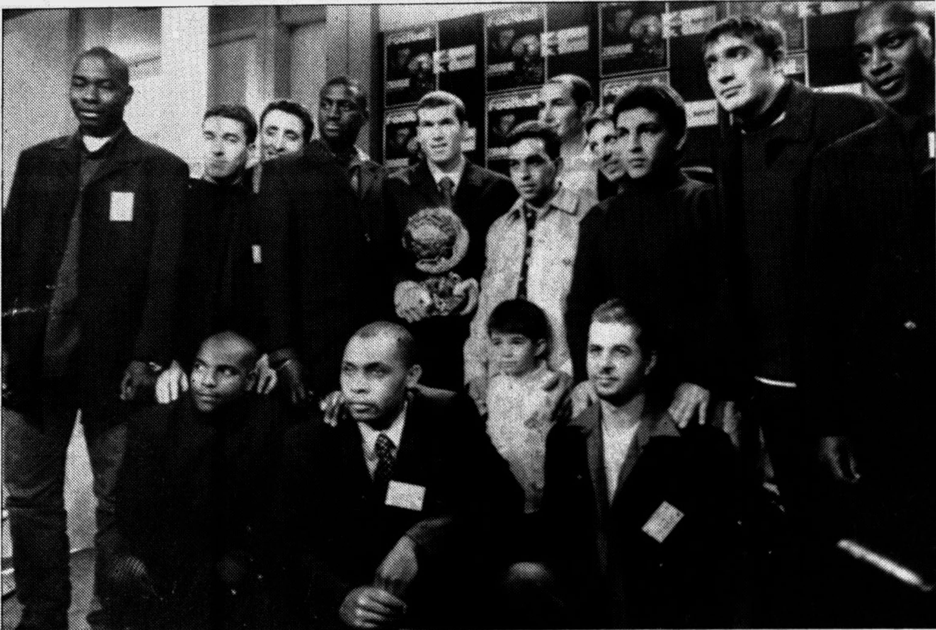
French playmaker Zinedine Zidane, seen with the European footballer-of-the-year trophy, is flanked by his friends from Marseille after receiving the award in Paris on December 21.