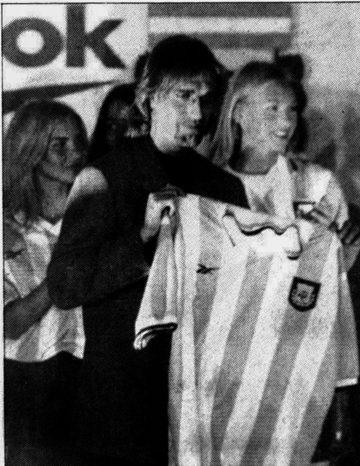
Ace striker Gabriel Batistuta displays the Argentina soccer team's new jersey during a ceremony in Buenos Aires on December 21.