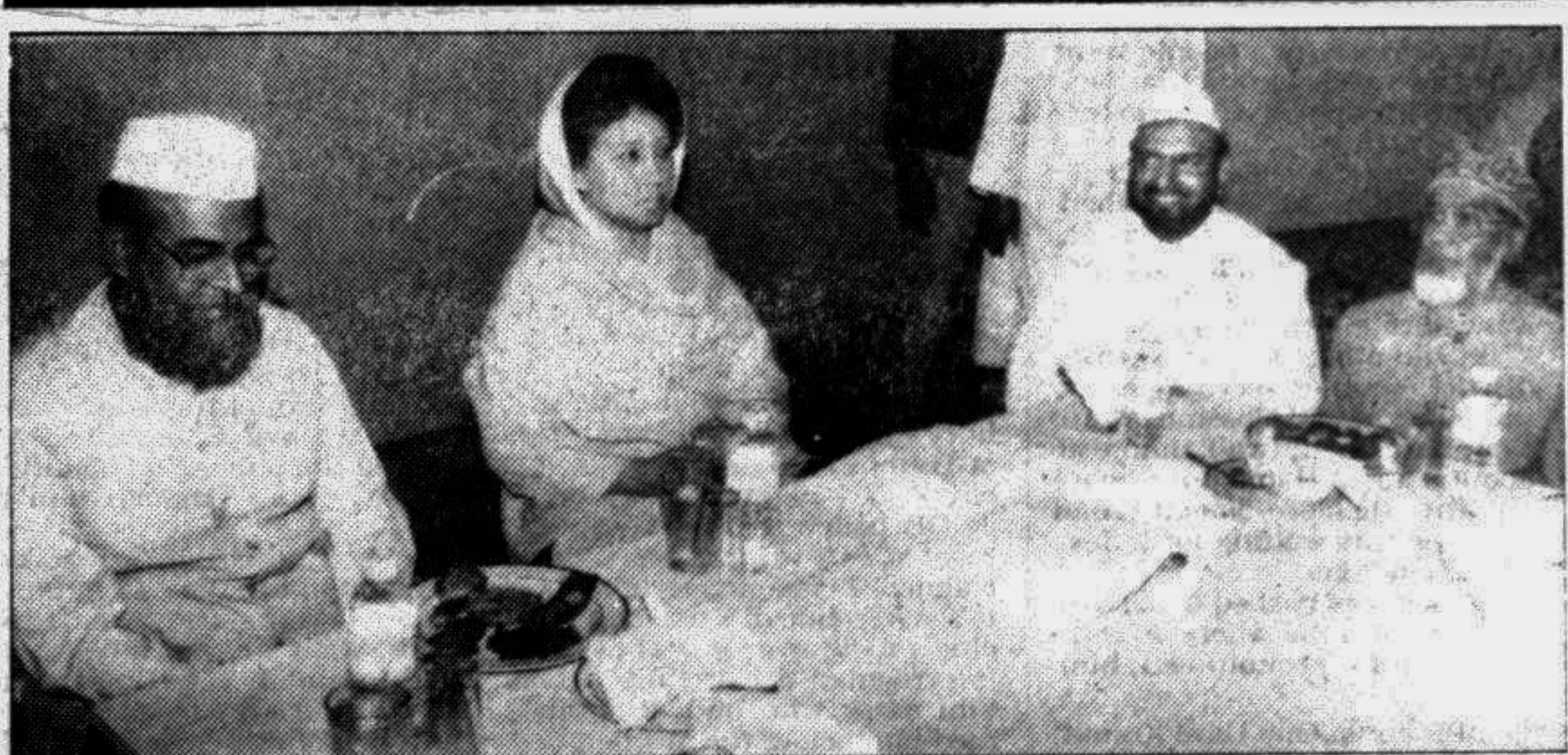
BNP Chairperson and Leader of the Opposition Begum Khaleda Zia seen at an Iftar party with the Musallis and Islamic thinkers at her Minto Road residence yesterday.

Children of 3 to 14 years of age have been invited to join the competition. Interested competitors are advised to enlist their names, along with the names of guardians, date of birth, school and class, full address, phone no (if any), etc with the central Kachi-Kanchar Mela, 37/A, Segun Bagicha, Dhaka-1000. Phone 414535.