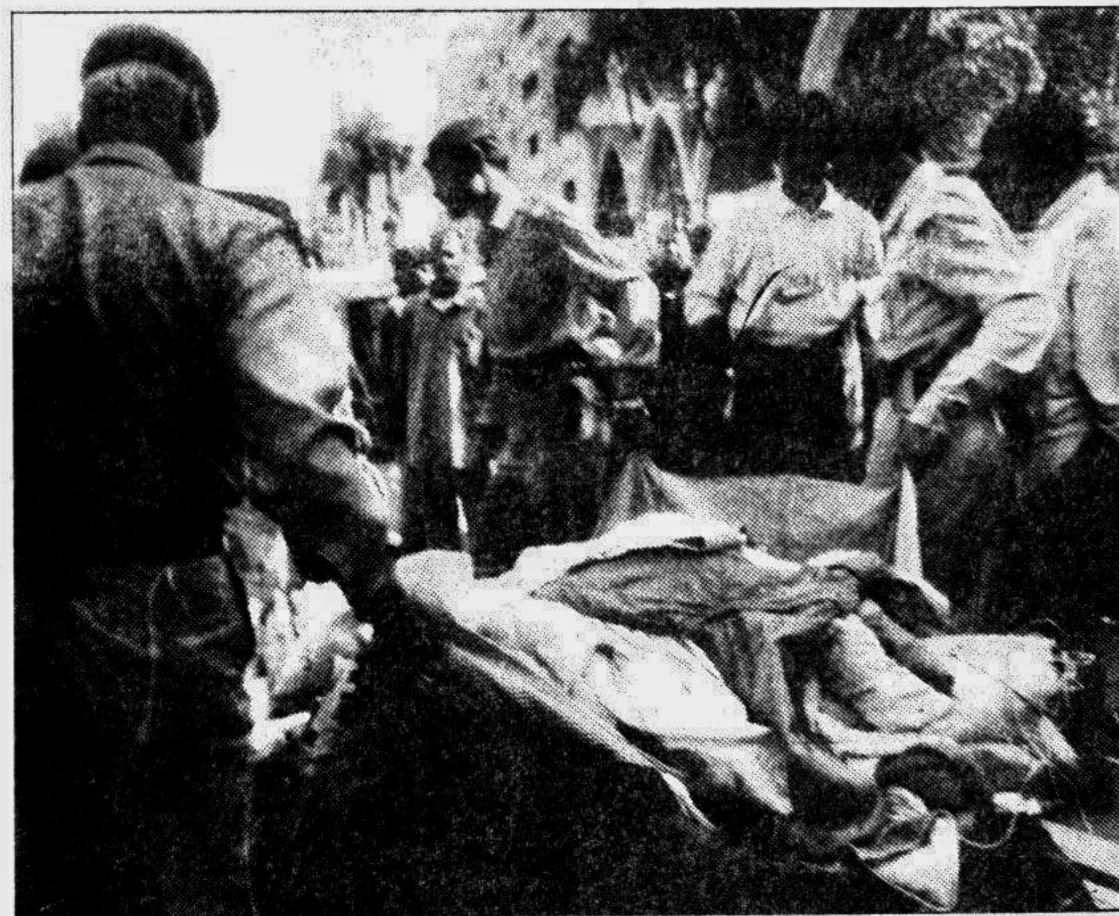
Police seen evicting hawkers from the footpath adjoining the Baitul Mukarram Mosque premises yesterday.