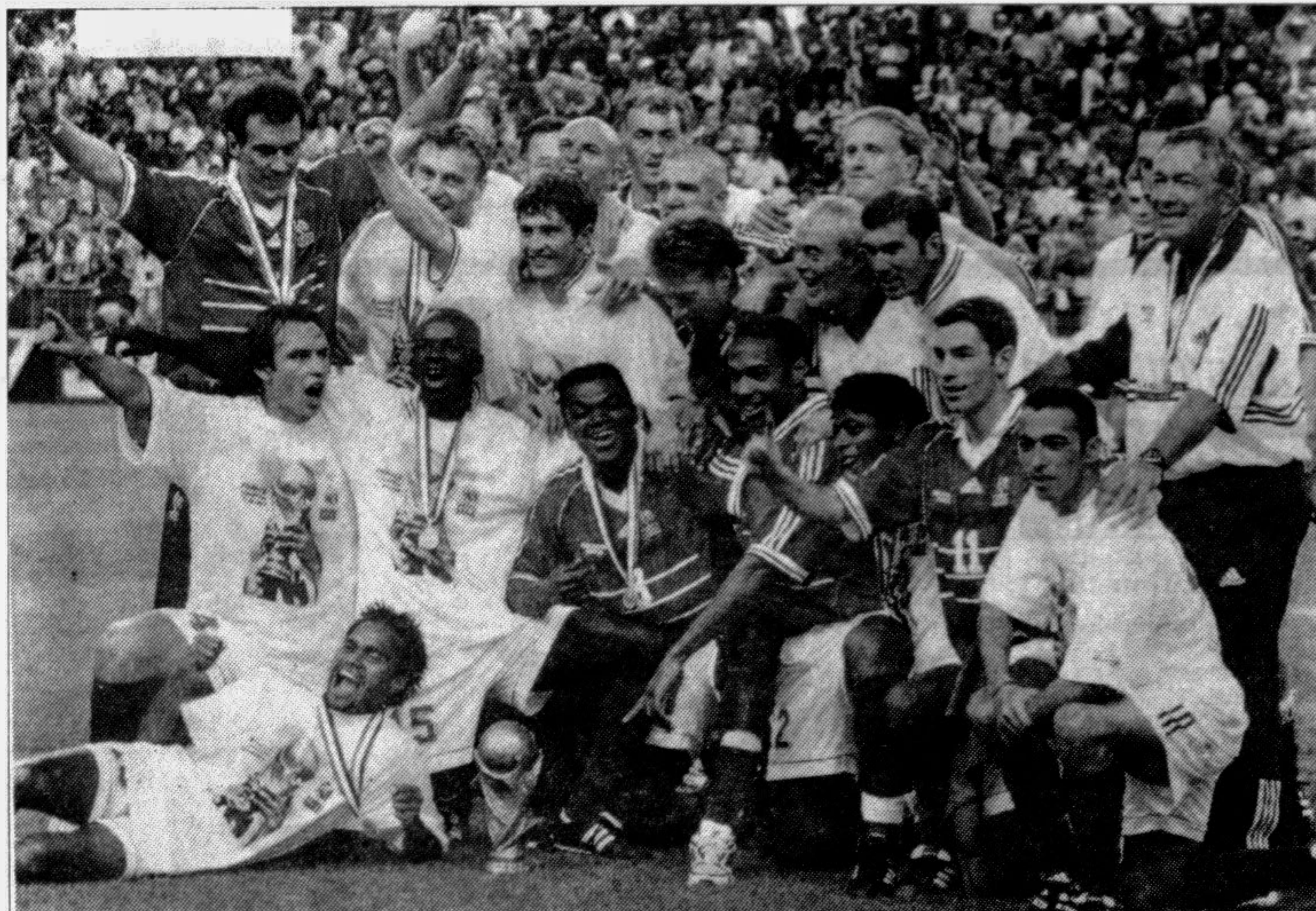
VIVE LA FRANCE! The World Cup winning French soccer team.