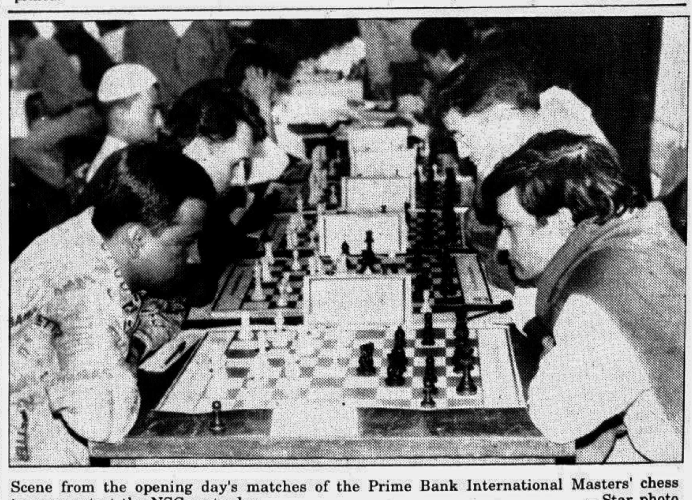
Scene from the opening day's matches of the Prime Bank International Masters' chess tournament at the NSC yesterday.