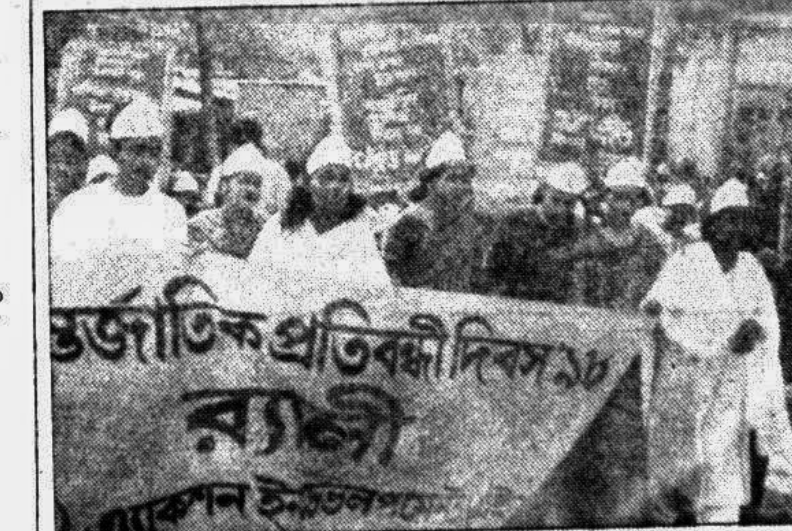
JHENIDAH: A colourful rally was brought out in the town recently in observance of International Day of the Disabled.