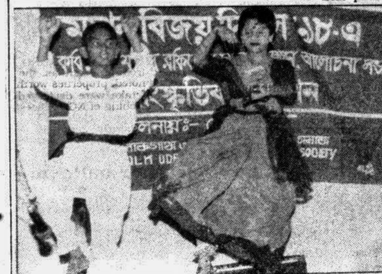
JHENIDAH: Two child artistes dancing in a Victory Day function here.