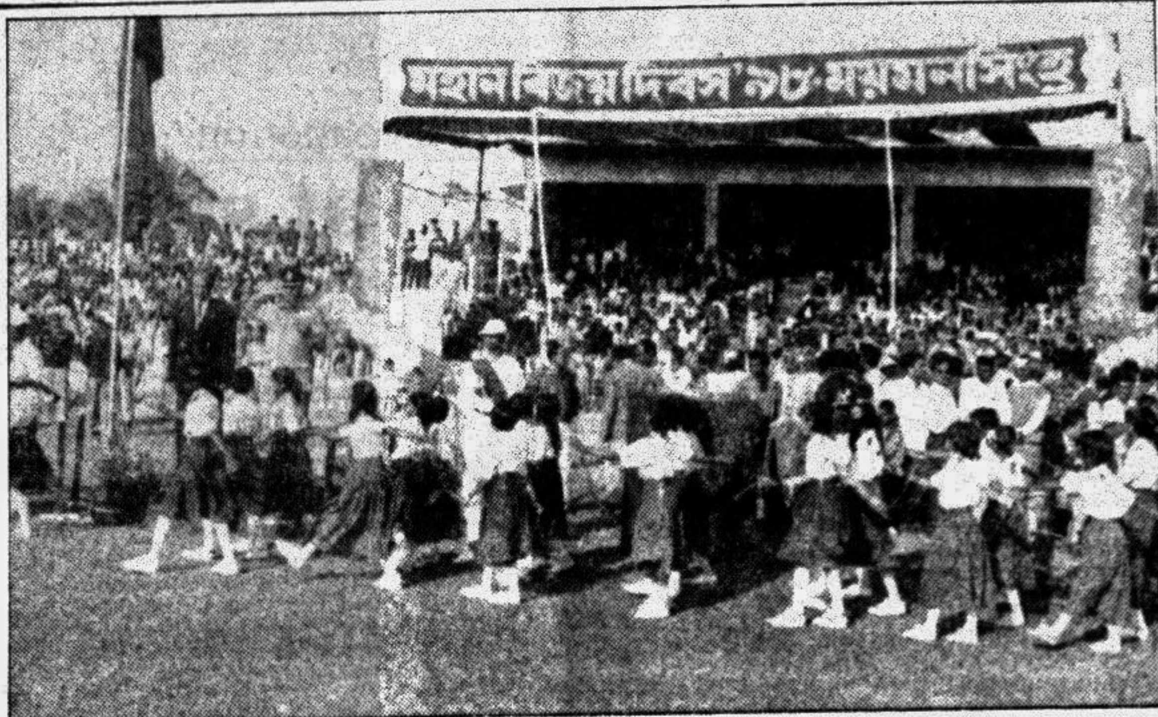
MYMENSINGH: A colourful march past by the school children at Mymensingh Stadium on the Victory Day.

At least 15 passengers were wounded in the attack.