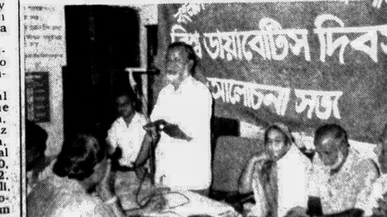
FARIDPUR: World Diabetes Day was observed here befittingly on November 14. Photo shows the local civil surgeon speaking at a discussion meeting which was arranged on the occasion.