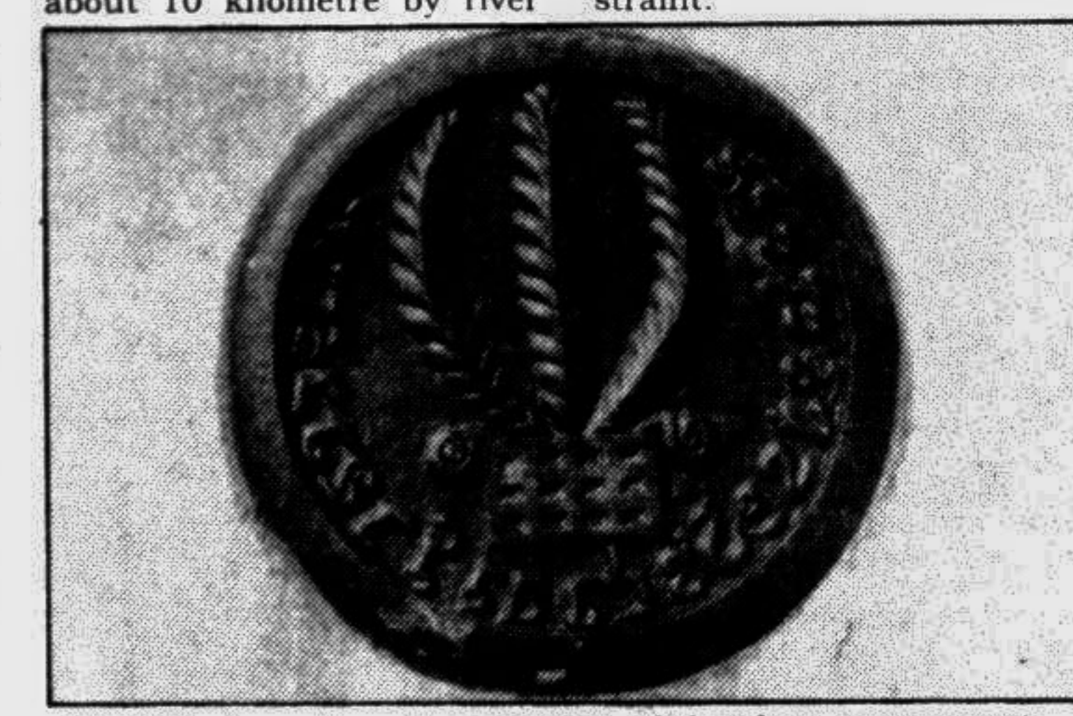
BOGRA: A replica of monogram of the then government.

The ruins of various articles and buildings of Mourja, Sunga, Kushan, Shashanka, Paul, Sen and Muslim period were unearthed. The history of Mohasthan is so wide that the archaeologists and the historians apprehend that development of its art and culture can be unveiled within the next 200 years. The main reasons are lack of manpower, modern technology and fund constraint.