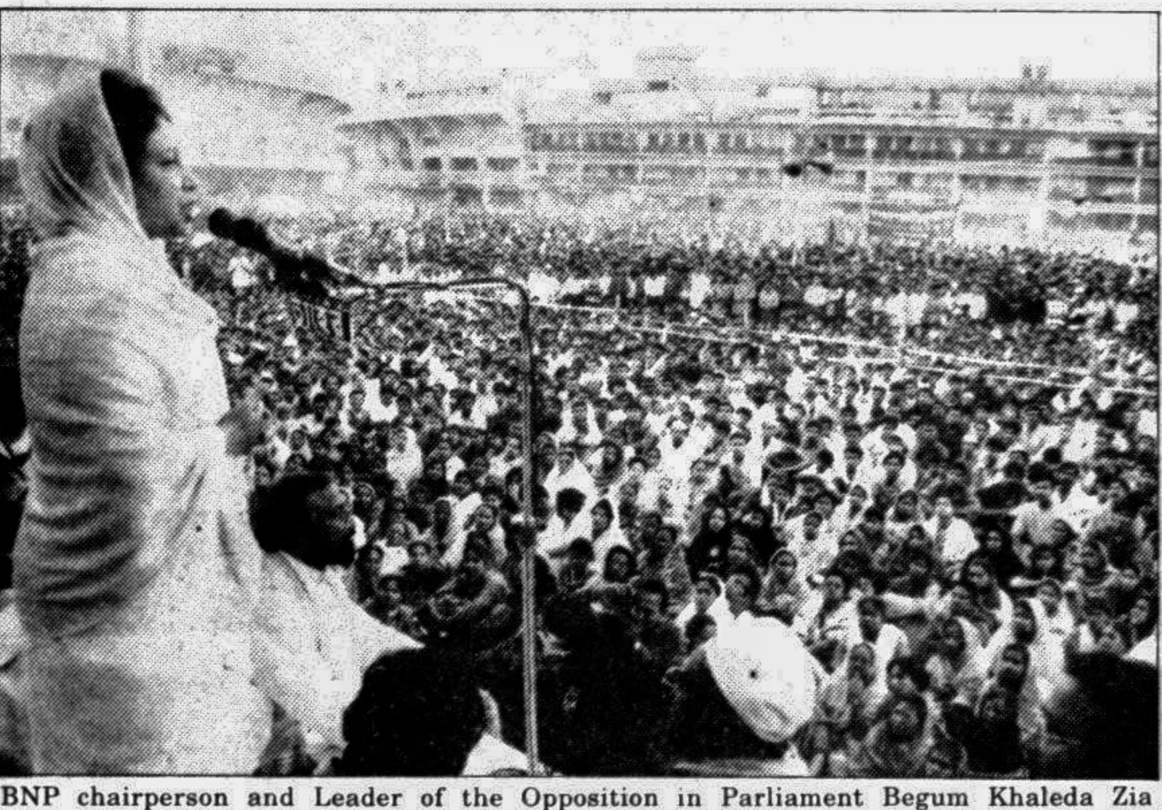
BNP chairperson and Leader of the Opposition in Parliament Begum Khaleda Zia addressing a public meeting at Paltan Maidan yesterday.