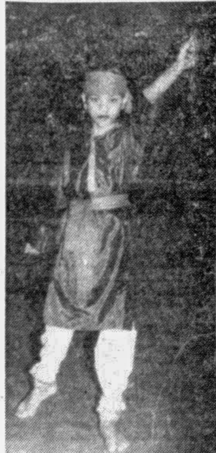
A child artiste performing dance at the Central Shaheed Minar yesterday.

The exhibition will be held at House 20, Road 42, Gulshan and will remain open from 10 am to 5 pm.