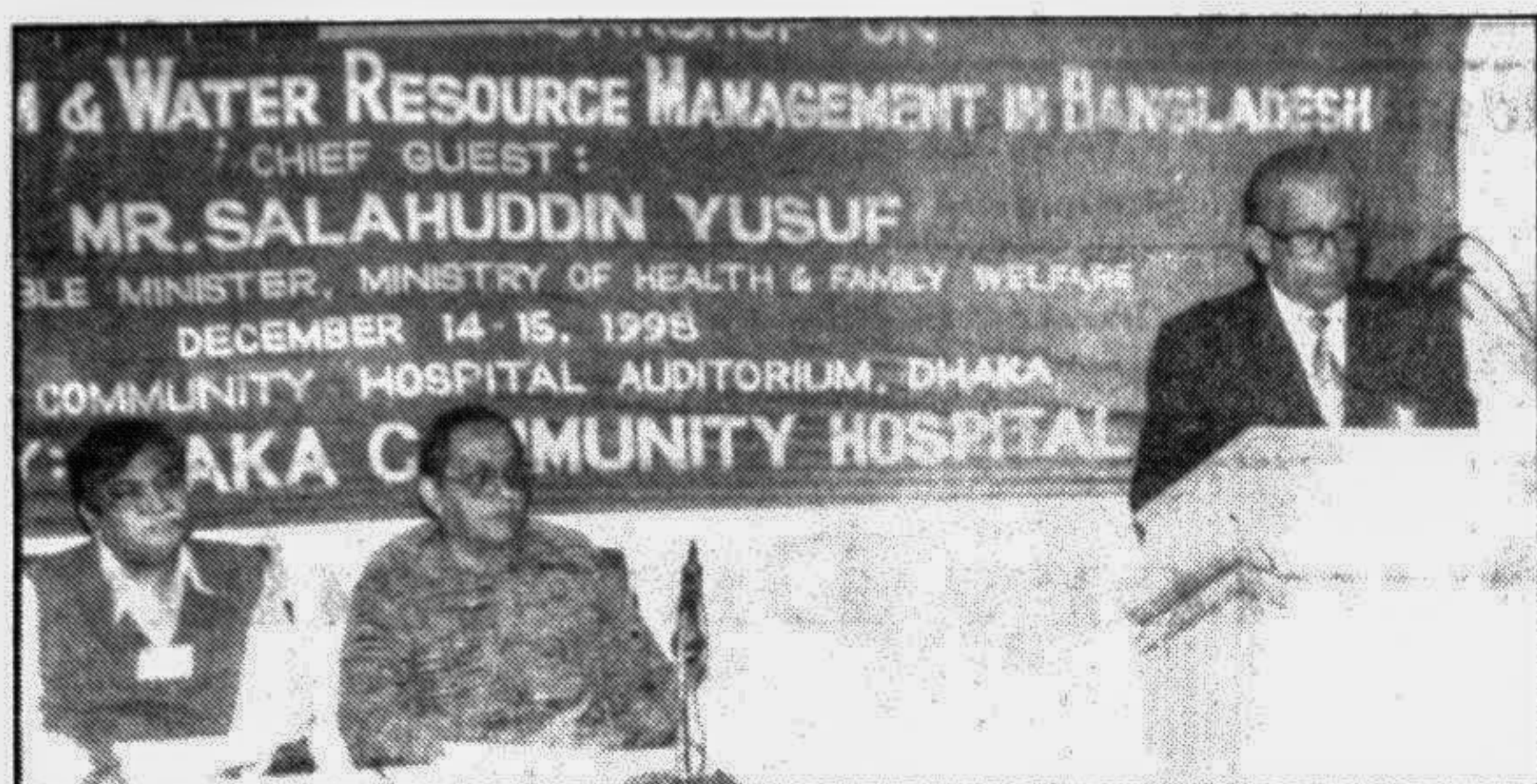
Health Minister Salahuddin Yusuf speaking at a 2-day international workshop on 'Arsenic problem and water resource management in Bangladesh' at the Dhaka Community Hospital auditorium yesterday.