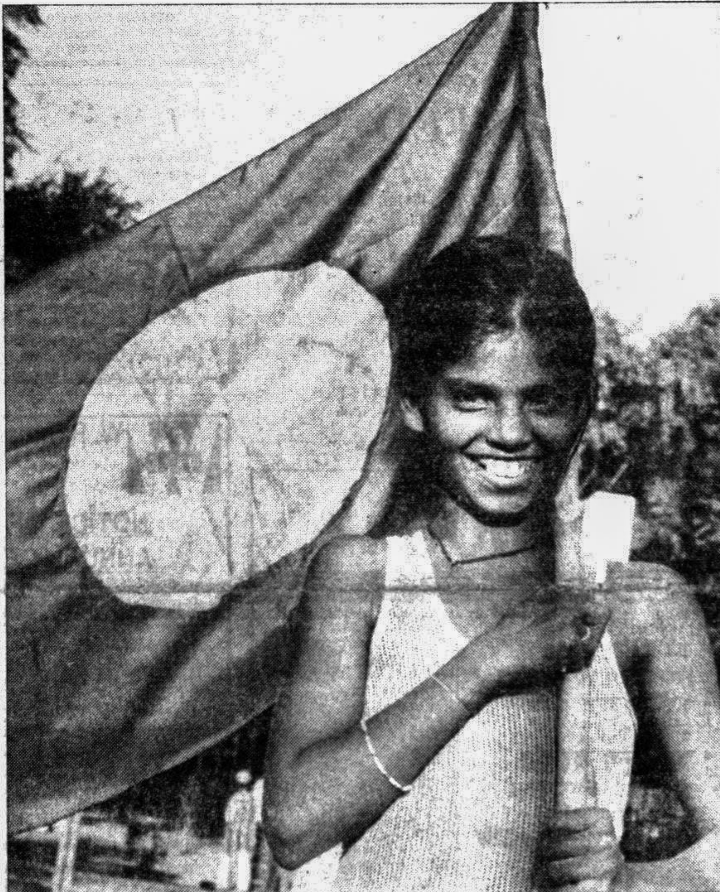
"Freedom you are the juvenile poems of Tagore ..."

The day is a public holiday. A 31-gun salute will herald the day. The National Flag will be hoisted atop of all public and private buildings. Newspapers will publish special supplements while the Radio and BTV See Page 12 Col 6