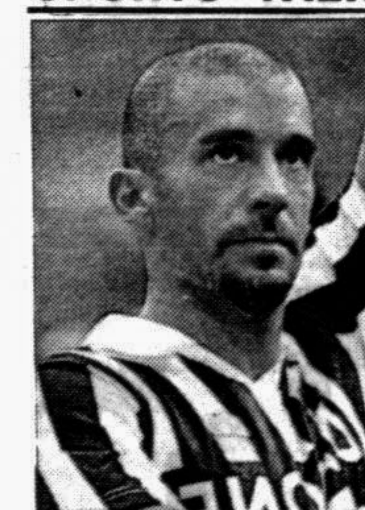
Gianluca Vialli (Chelsea's player-cum-manager) "I've always been a perfectionist. That's the way I am."