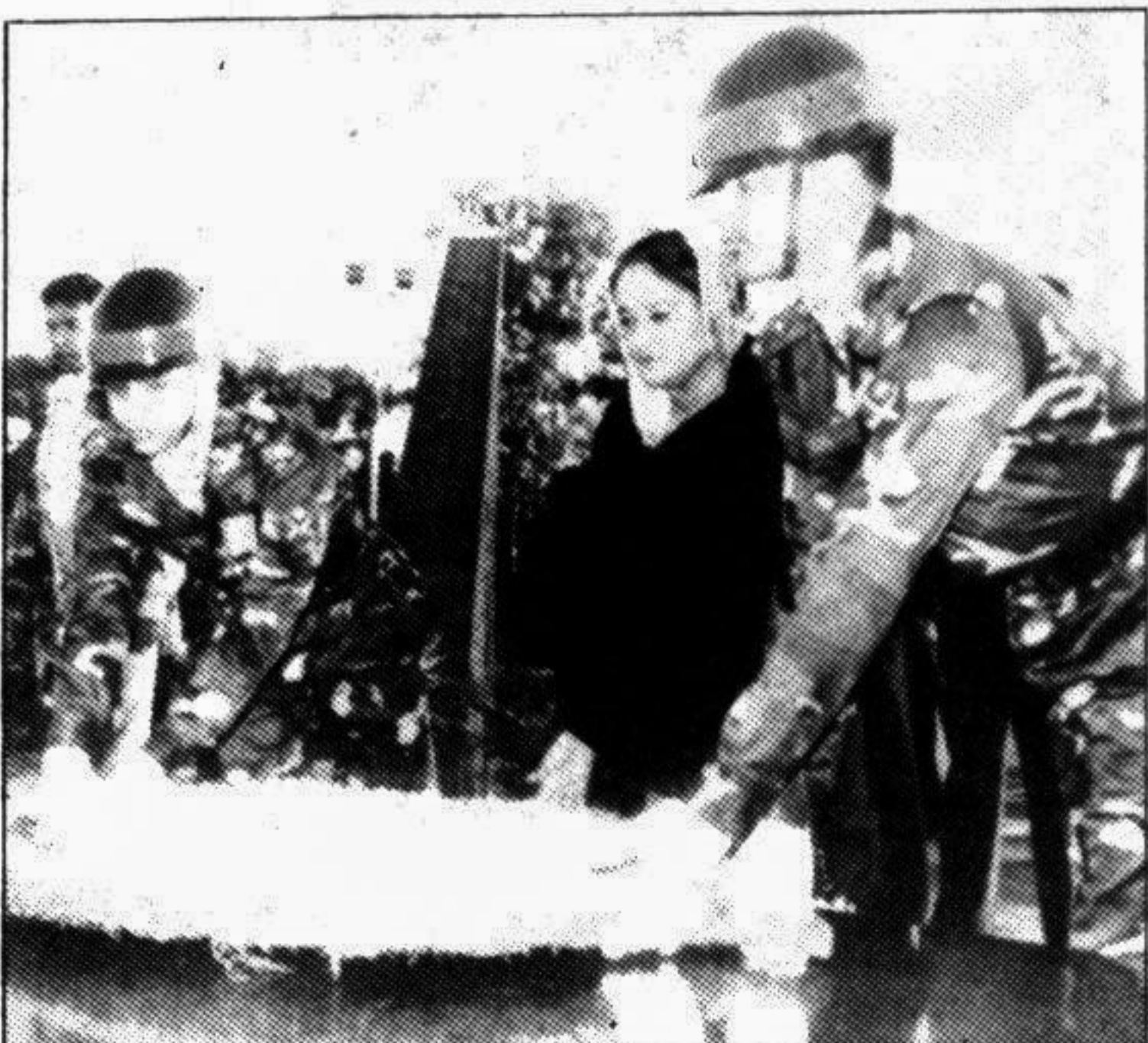
Prime Minister Sheikh Hasina places wreath at the Martyred Intellectuals' Memorial at Mirpur in the city yesterday.

Another stage named 'Lokoj Mancha' and fair styled 'Mukjuddaha mela' have also been set up at the university playground. Artists from different parts of the country presented Baul songs.