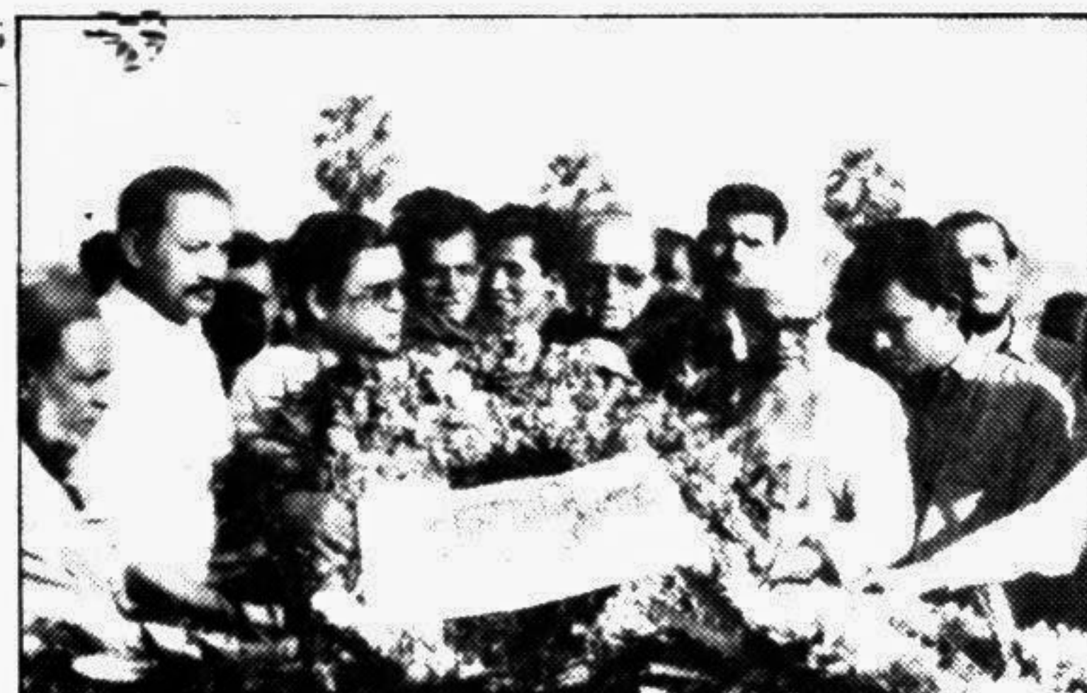
Ghatik Dal Nirmul Committee