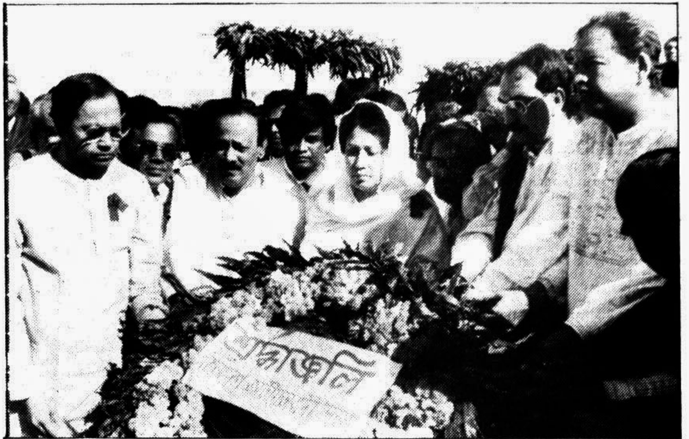
BNP chairperson Khaleda Zia along with party leaders placing wreaths at the Martyred Intellectuals' Memorial in Mirpur yesterday.