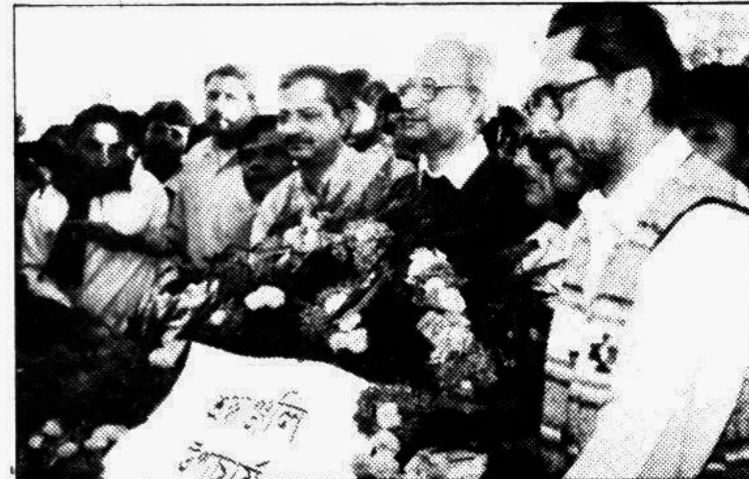
Bangladesh University of Engineering and Technology