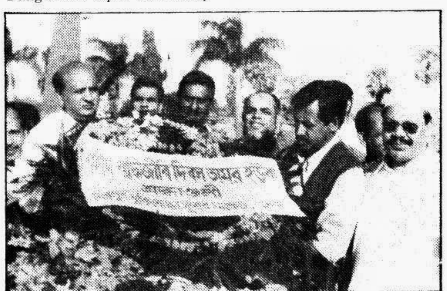
Mirpur Muktijoddha Super Market.

Various political and socio-cultural organisations placed wreaths at the Martyred Intellectuals' Memorial yesterday to pay homage to the worthy sons of the soil who were brutally killed by the Pakistani occupation forces and their local collaborators at the fag end of the War of Liberation. —Star photo