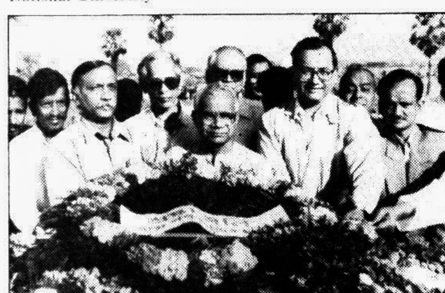
Left Democratic Front (LDF)