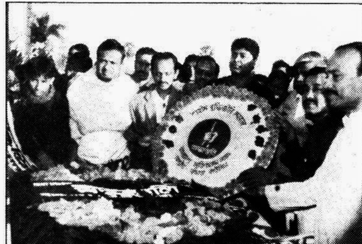
Muktijoddha Sangsad Central Command Council