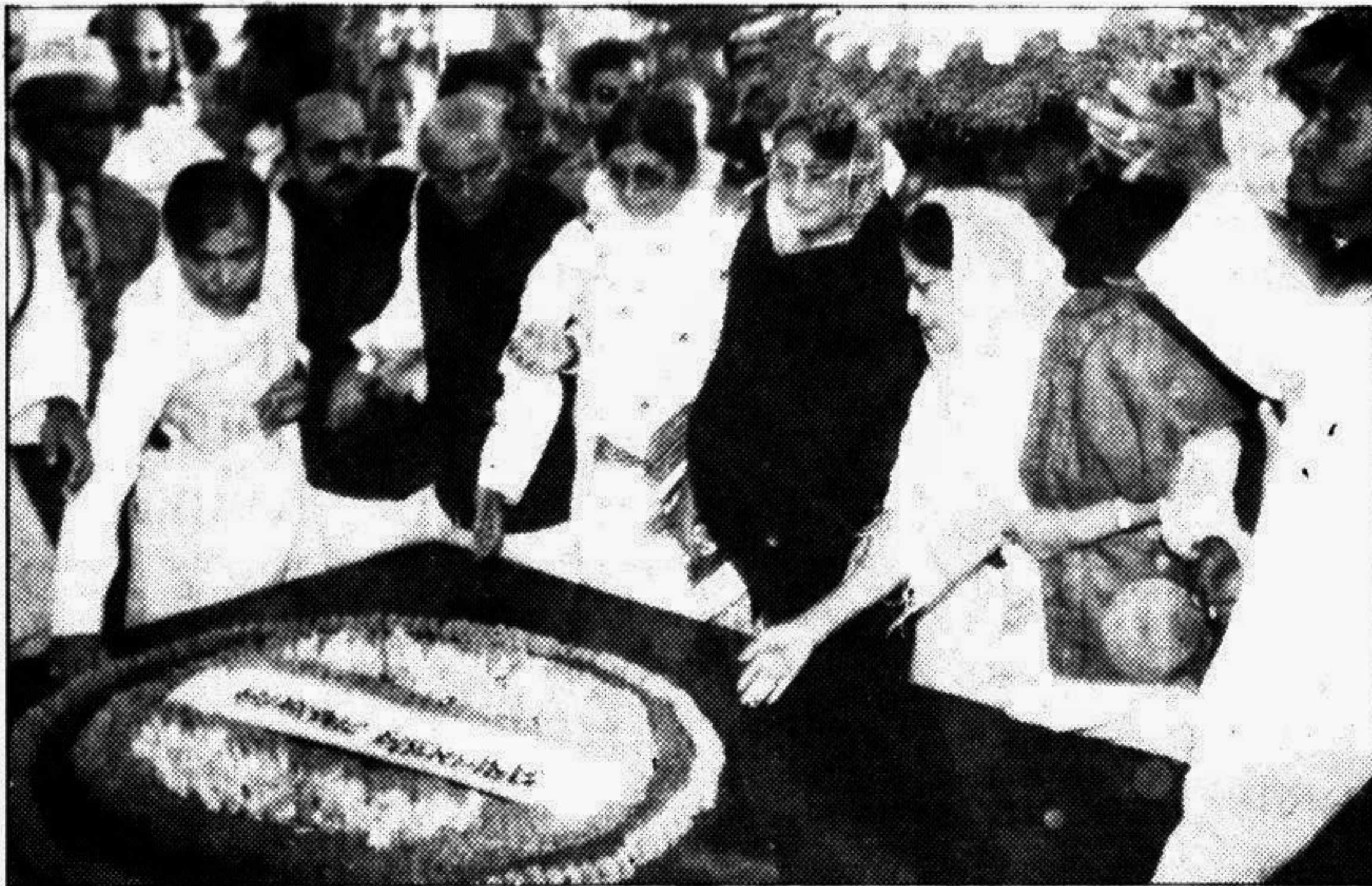
Awami League leaders led by Prime Minister Sheikh Hasina placing wreaths at the Martyred Intellectuals' Memorial in Mirpur yesterday.