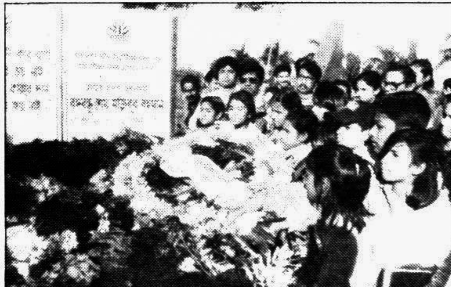
Bangladesh Shishu Academy