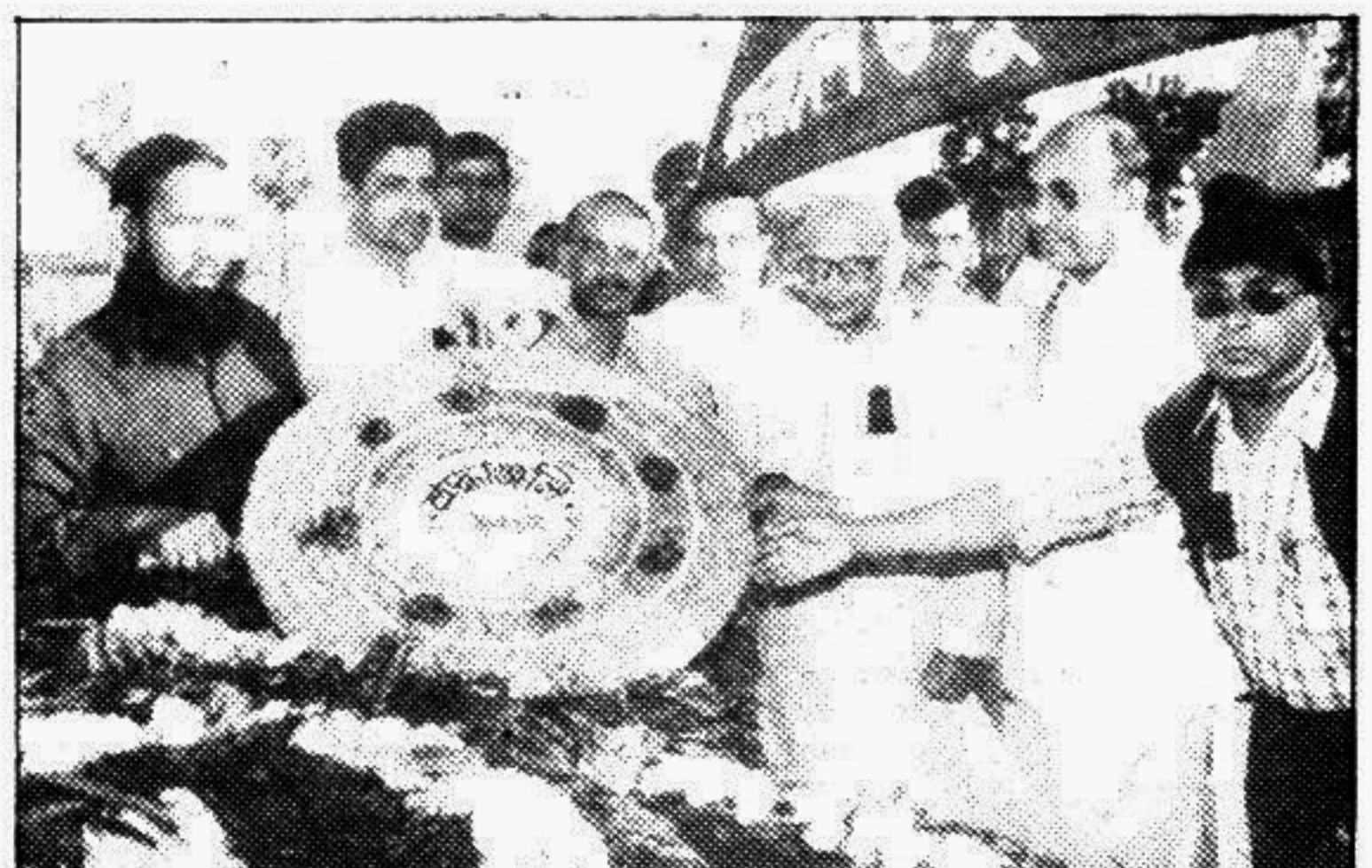
Bangladesh Open University