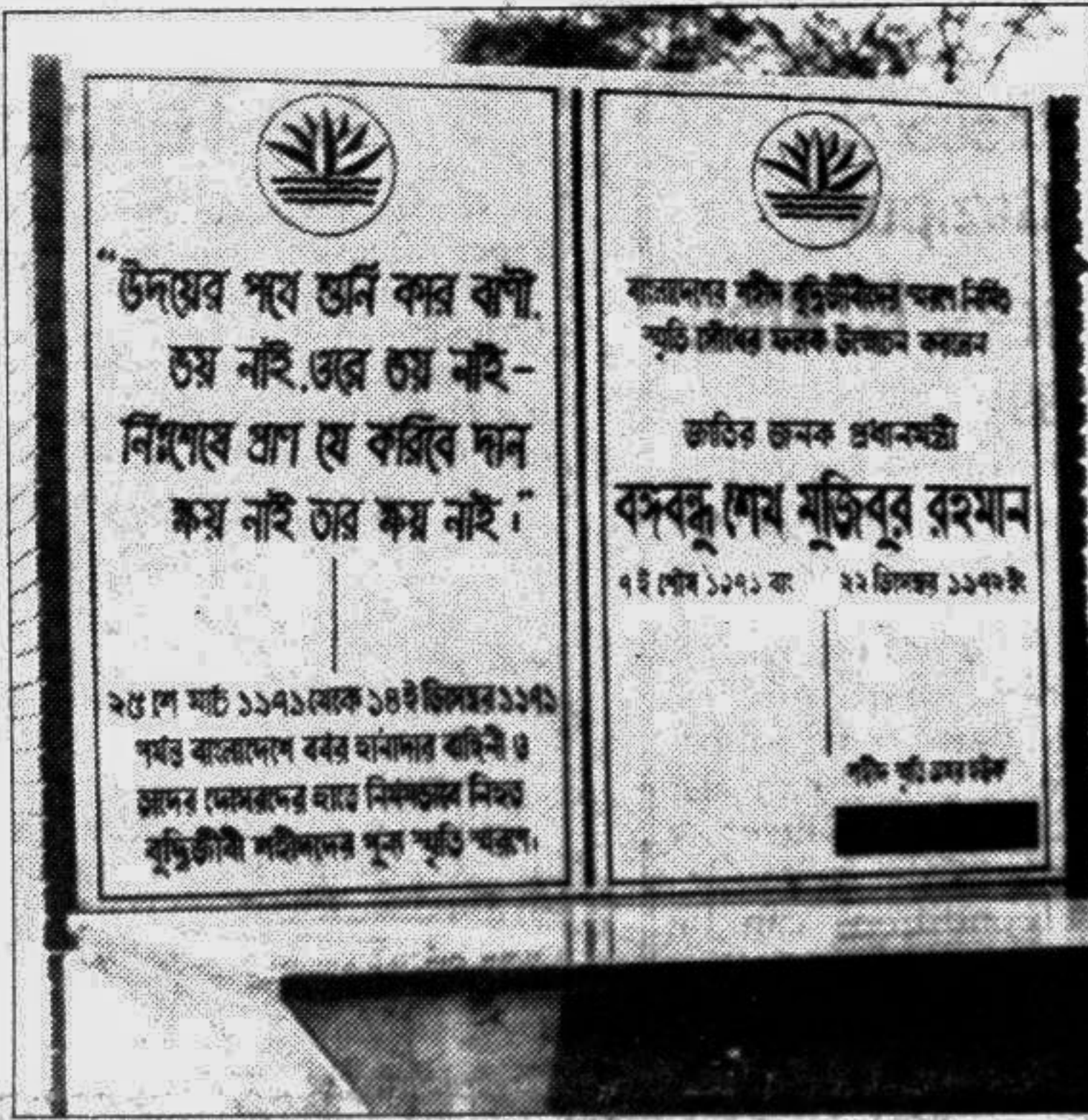
The Martyred Intellectuals Memorial at Mirpur.