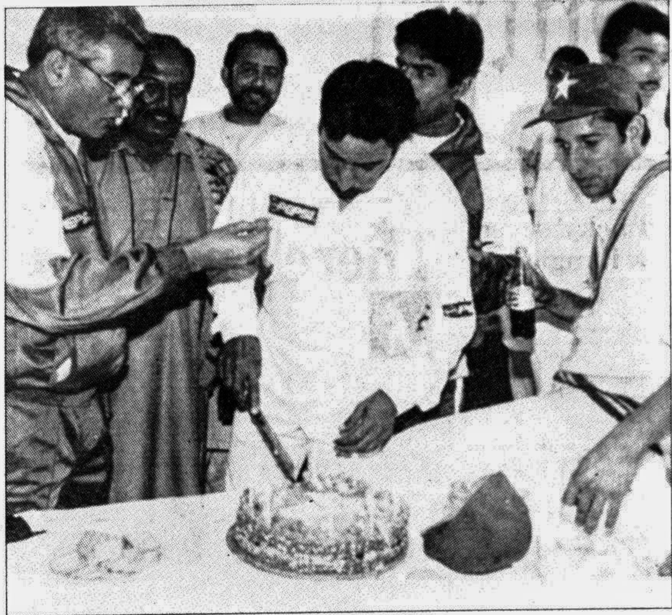
JOINING THE HUNDRED CLUB: Veteran Pakistan batsman Salim Malik celebrating his 100th Test appearance by cutting a cake while being surrounded by teammates and officials at Lahore on Thursday.

ADELAIDE, Dec 11 (Reuters/Internet): New South Wales were dismissed for their lowest score in Sheffield Shield history on Friday, skittled out for just 56 on a bouncy WACA pitch by a fired-up Western Australian side.