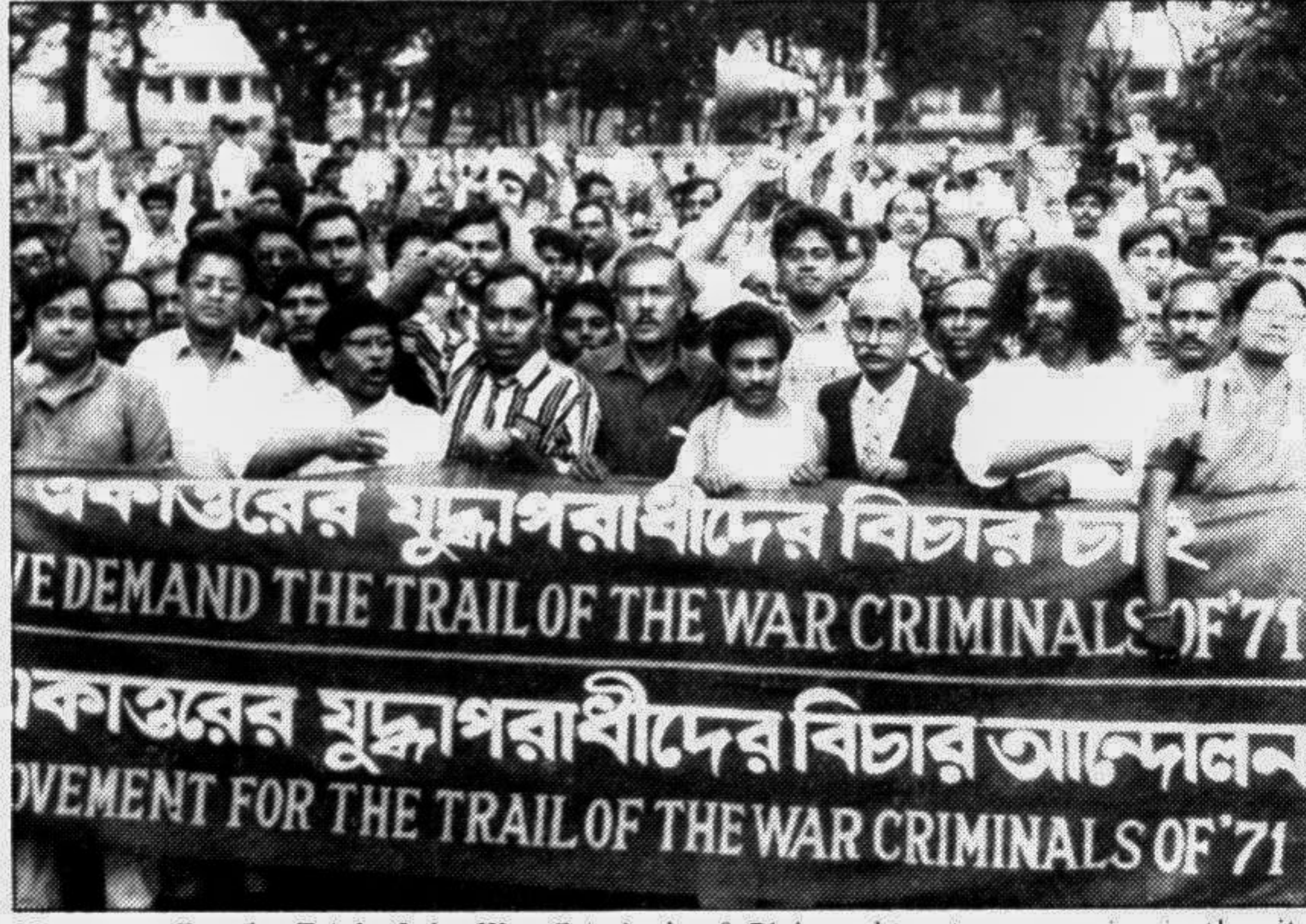
Movement for the Trial of the War Criminals of '71 brought out a procession in the city yesterday demanding trial of all war criminals.