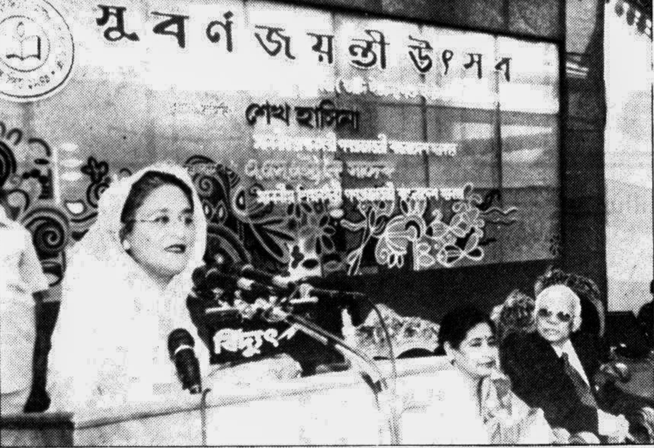
Prime Minister Sheikh Hasina speaking at the Golden Jubilee celebrations of Begum Badrunessa Government Women's College yesterday.