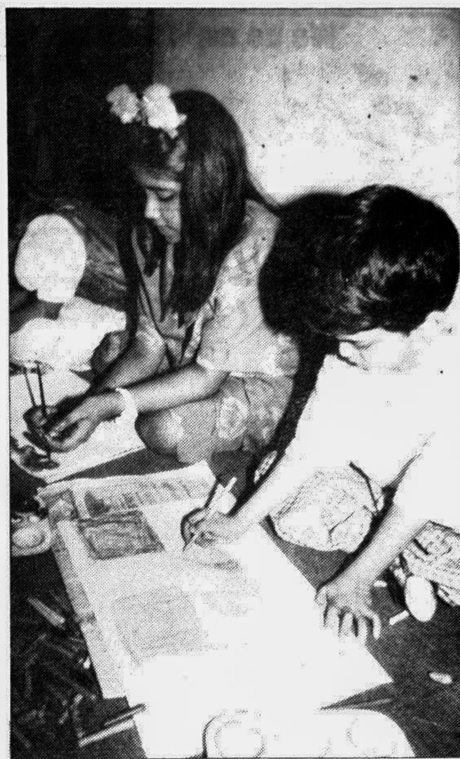
ASPIRING ARTISTS: Children taking part in a drawing competition organised by Shishu Academy yesterday as part of the Victory Day celebrations.

The paper focussed that the major activities of LGED's rural development projects are being implemented through contractor, project implementation committee, labour contracting societies (LCS), contracting group and maintenance crews.