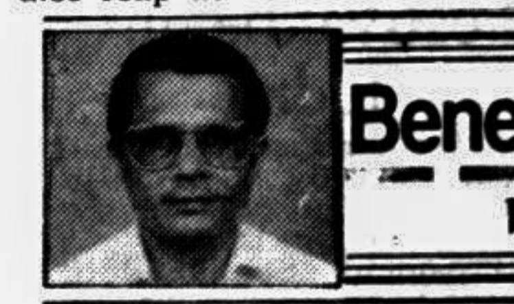
Beneath the Surface by Abdul Bayes

what kind of shoes would pinch the economy — where and how — and declared unequivocally to give up wearing that shoe. So, it is a movement on her part from the bad to the good. On the other hand, BNP was in power for five years and surely it knew where and how the shoe called hartal pinched the economy. Quite vocally — and possibly logically too — they termed these activities as "anti-state".