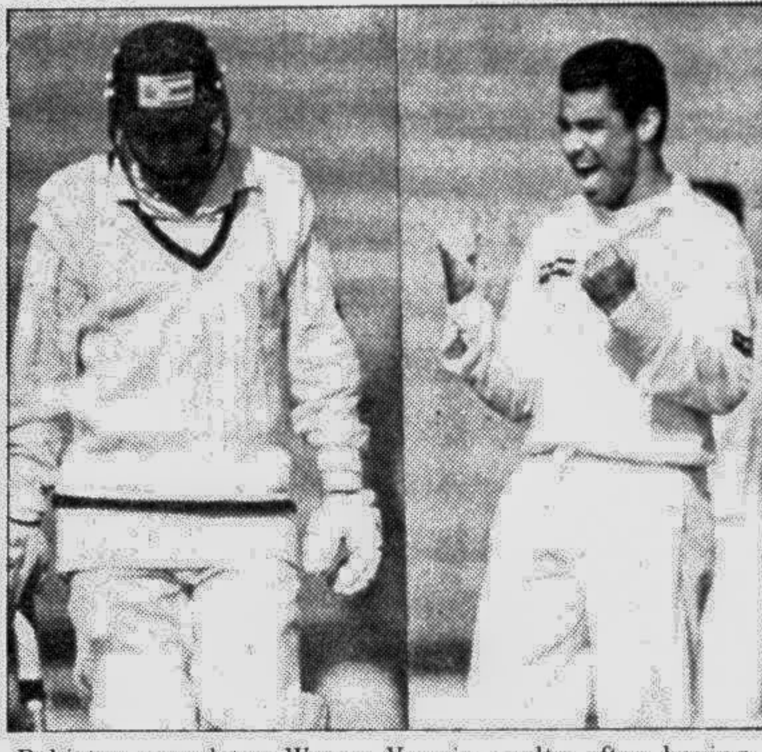
Pakistan speedster Waqar Younis exults after having Zimbabwe captain Alistair Campbell during the first day's play of the second Test in Lahore yesterday.