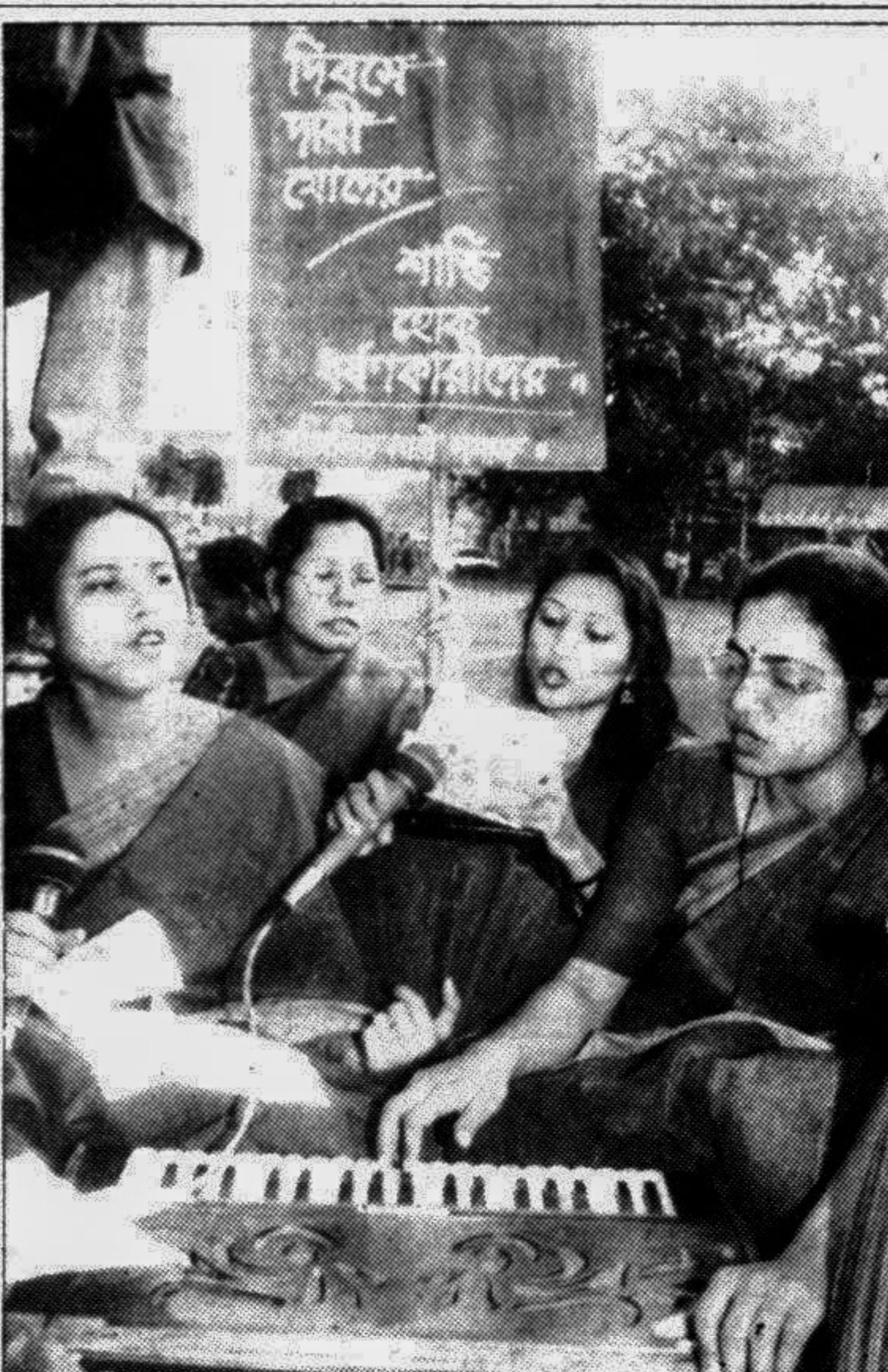
A Sammilita Nari Samaj cultural team rendered songs on different city streets as part of its programme in observance of Begum Rokeya Day yesterday.

But both groups worked on the same draft, which remained almost same.