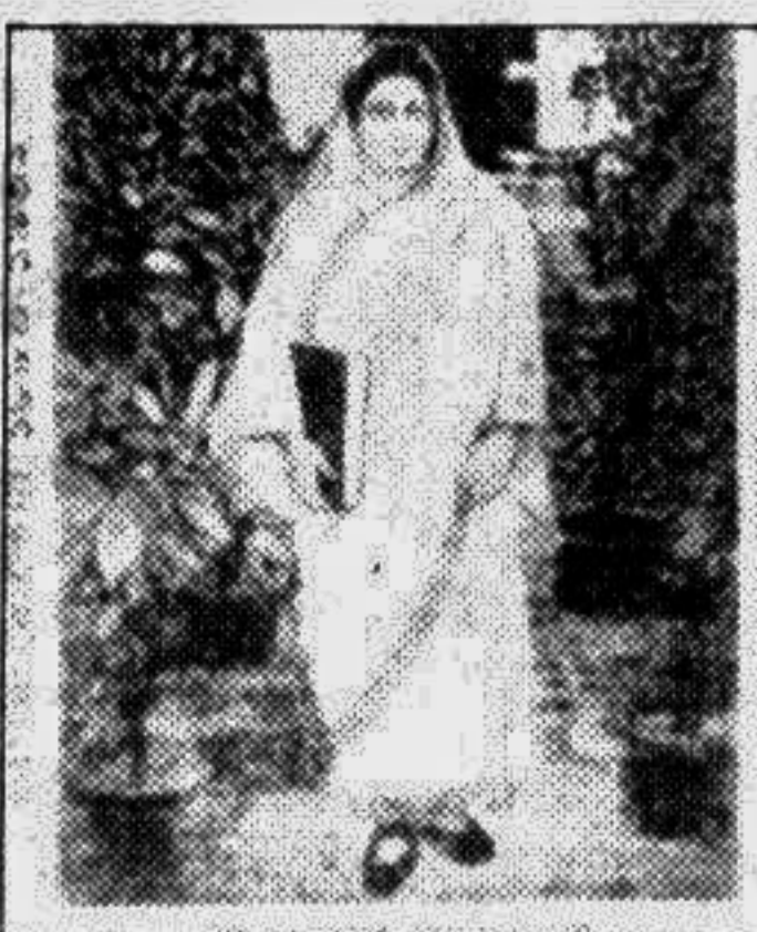
The First Day Cover

Prime Minister Sheikh Hasina released the stamp after distributing the Begum Rokeya Padak '98 at a function at Osmany Memorial Hall.