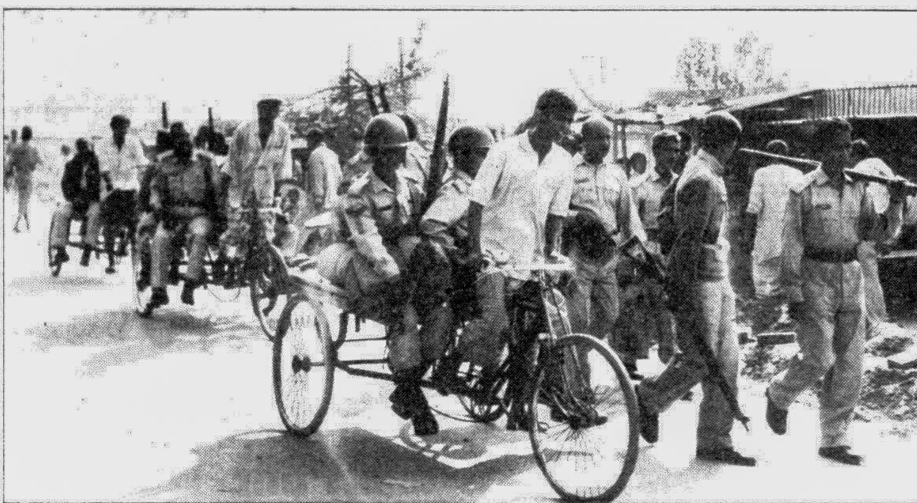
Security personnel going to polling centres in Pabna-2 constituency yesterday.

A 3-page supplement on BCS International Computer Show '98 on Pages 8, 9 & 10