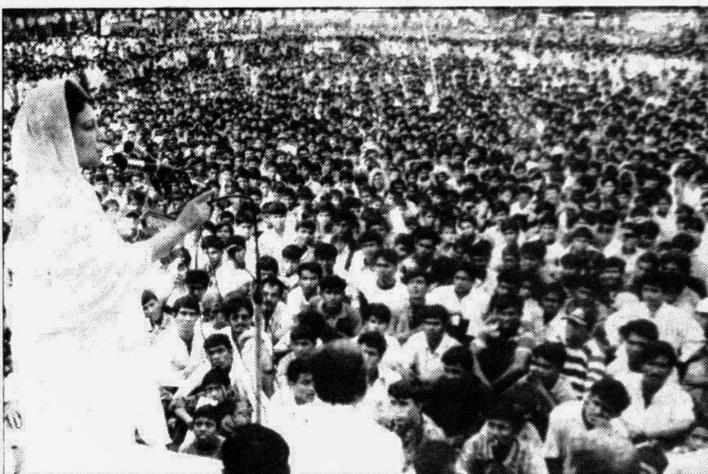
Begum Khaleda Zia addressing an election projection rally at Dulari High School ground in Pabna-2 Constituency yesterday.

Tariq Karim, High Commissioner to South Africa, has asked for voluntary retirement on personal grounds. Foreign Ministry sources said yesterday that Karim will proceed on voluntary retirement on January 1.