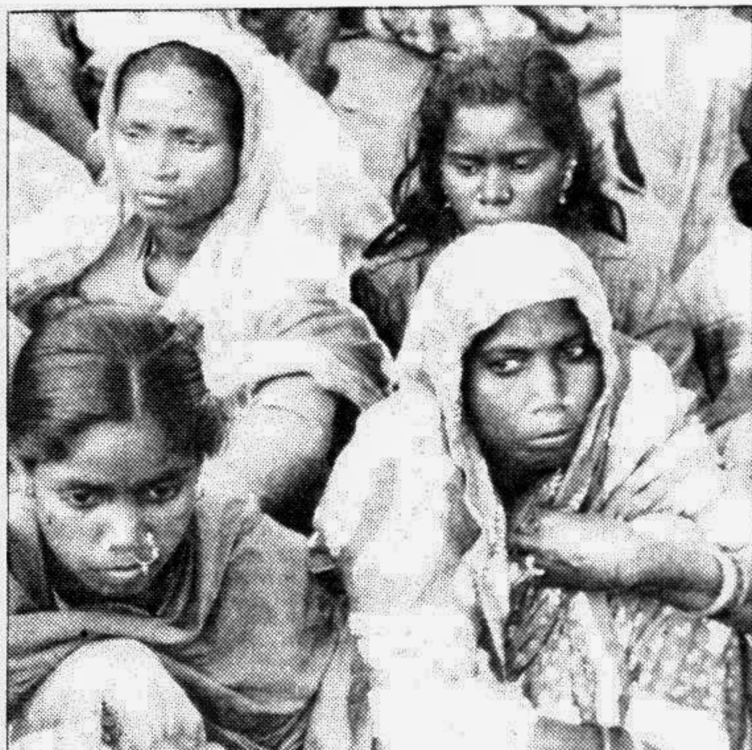
Indigenous people at a rally at the Diploma Engineers Institute in the city yesterday.

He assured the indigenous people of providing legal aid to protect their rights and said there are public funds in all districts and monitoring cells in