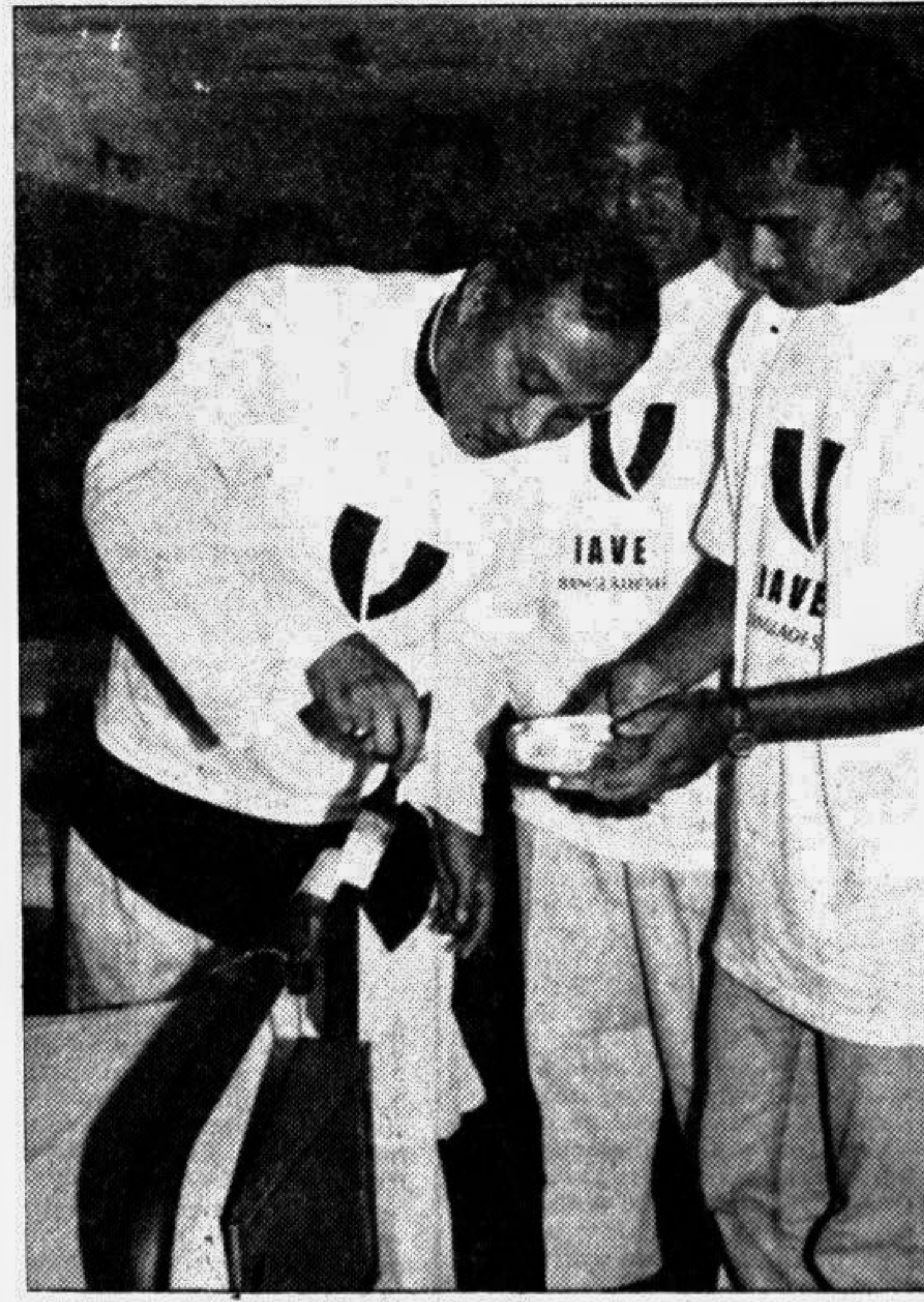
RANGAMATI: Local MP, Dipankar Talukder initiated the cleanliness drive at Rangamati General Hospital on the occasion of International Volunteer Day on December 5.

The well-off farmers have been collecting fodder at a high price from distant places to their animals but the poorer people are undone and compelled to sell their cattle at throwaway prices.