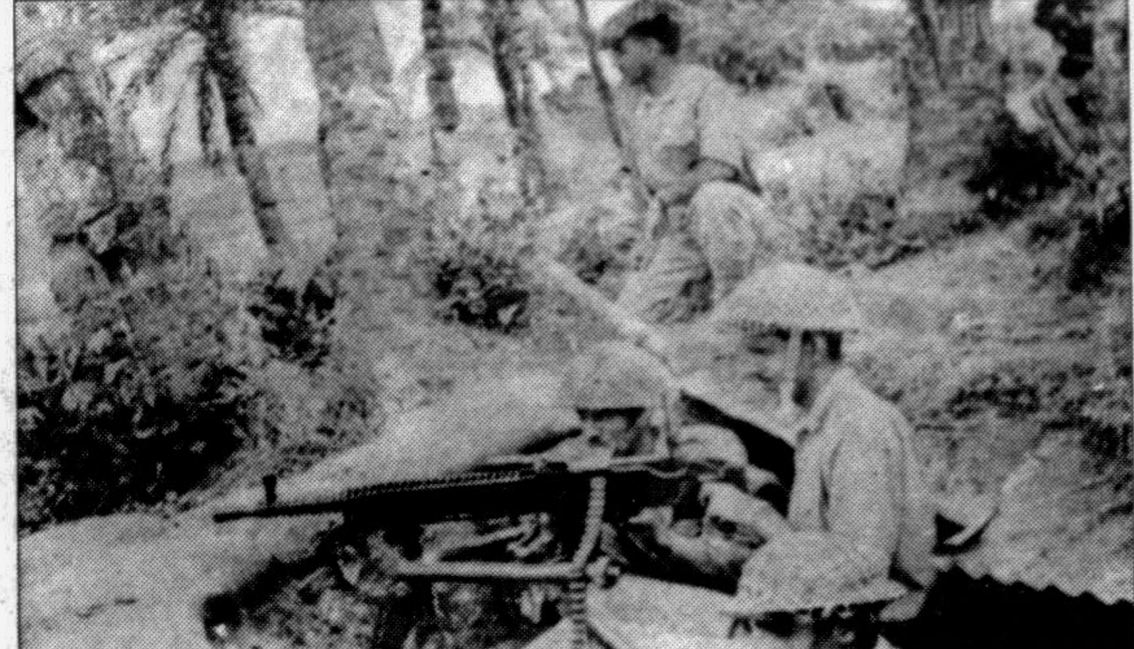
JESSORE: Freedom fighters in action against the Occupation Pakistan Army near Jessore Cantonment.