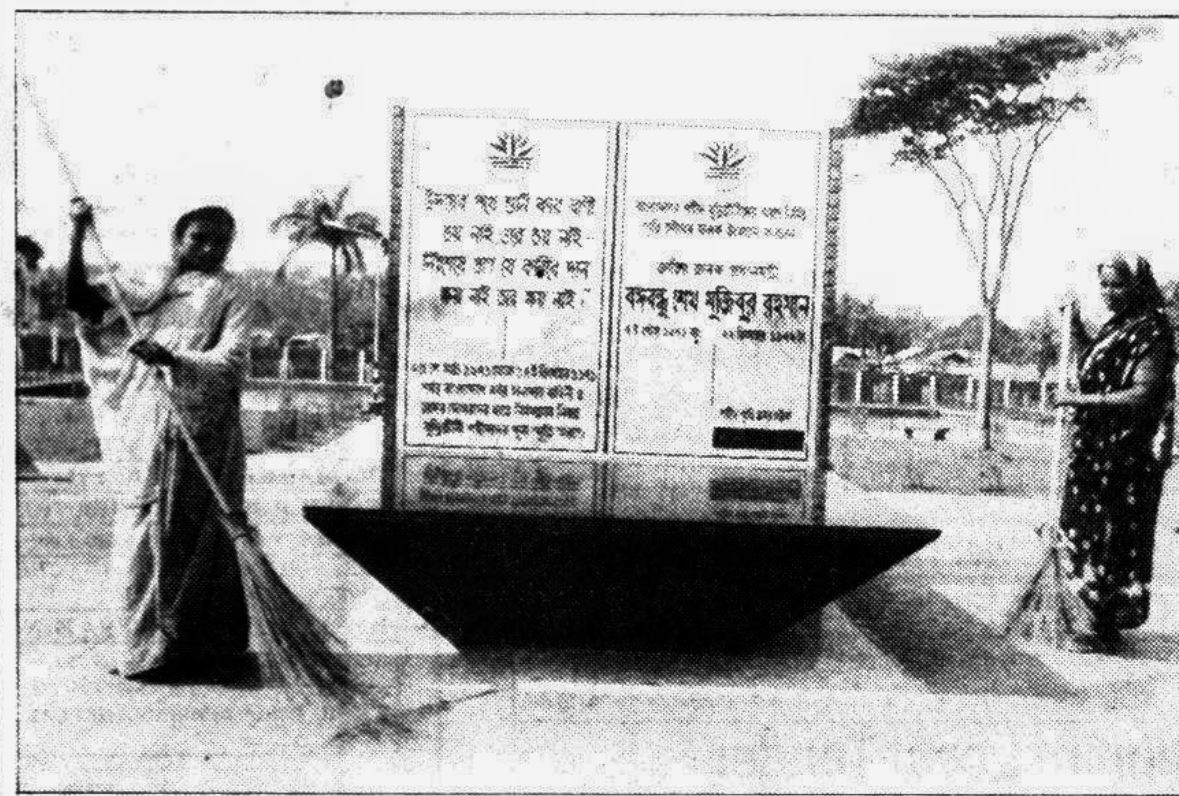
The Martyred Intellectuals Memorial at Mirpur in the city is being cleaned up ahead of the Shaheed Buddhijibi Dibash on December 14.

Advani told the member that it was not correct to say that all illegal immigrants were agents of Pakistan's army intelligence ISI. He, however, said that some were deliberately infiltrated as ISI agents while many others came to India for economic reasons.