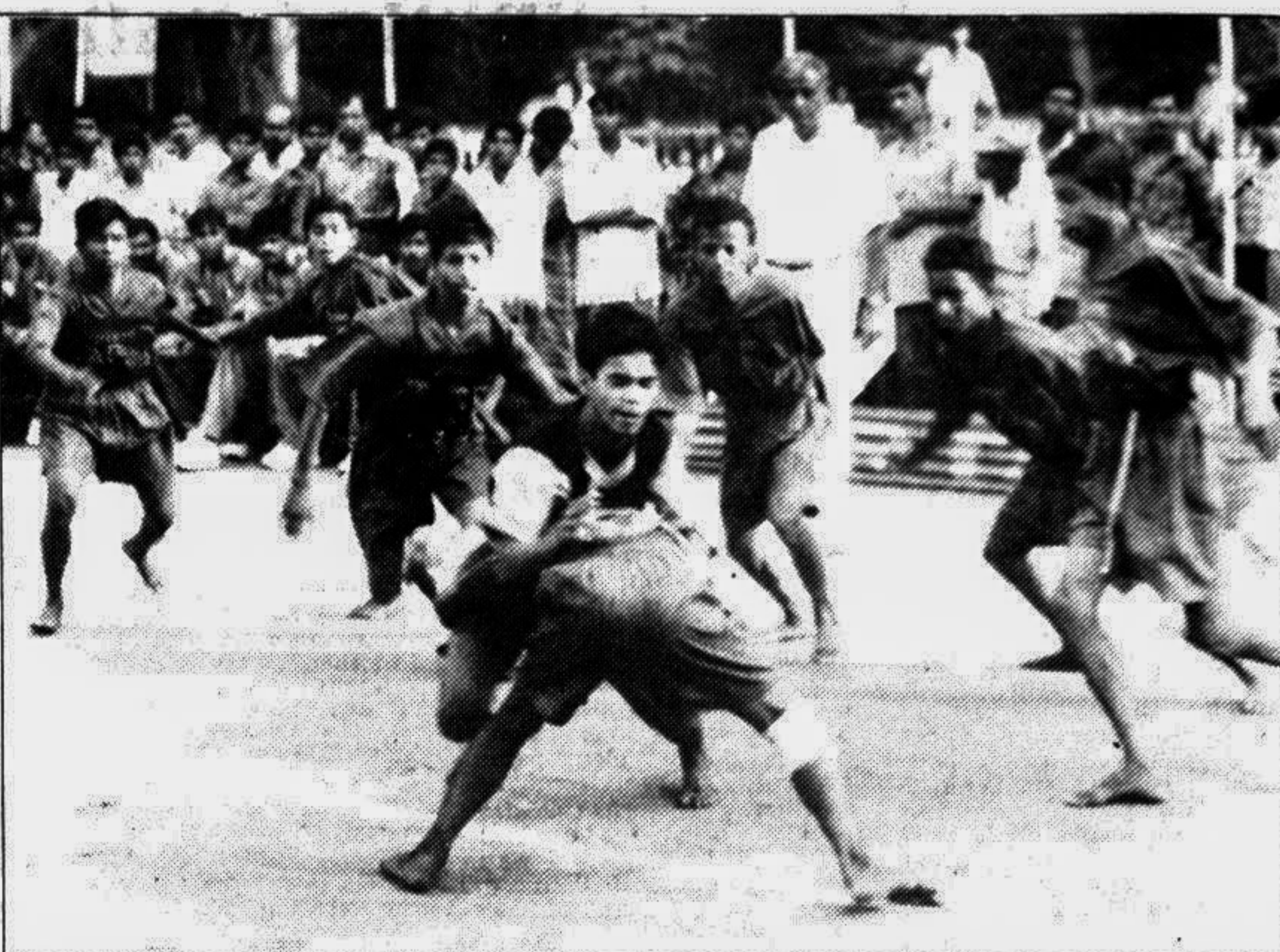
Scene from a schools kabadi encounter.

The result left Corretja 2-1 ahead in their meetings this season following Moya's victory in the French Open final and last week's rematch in the Hanover final.