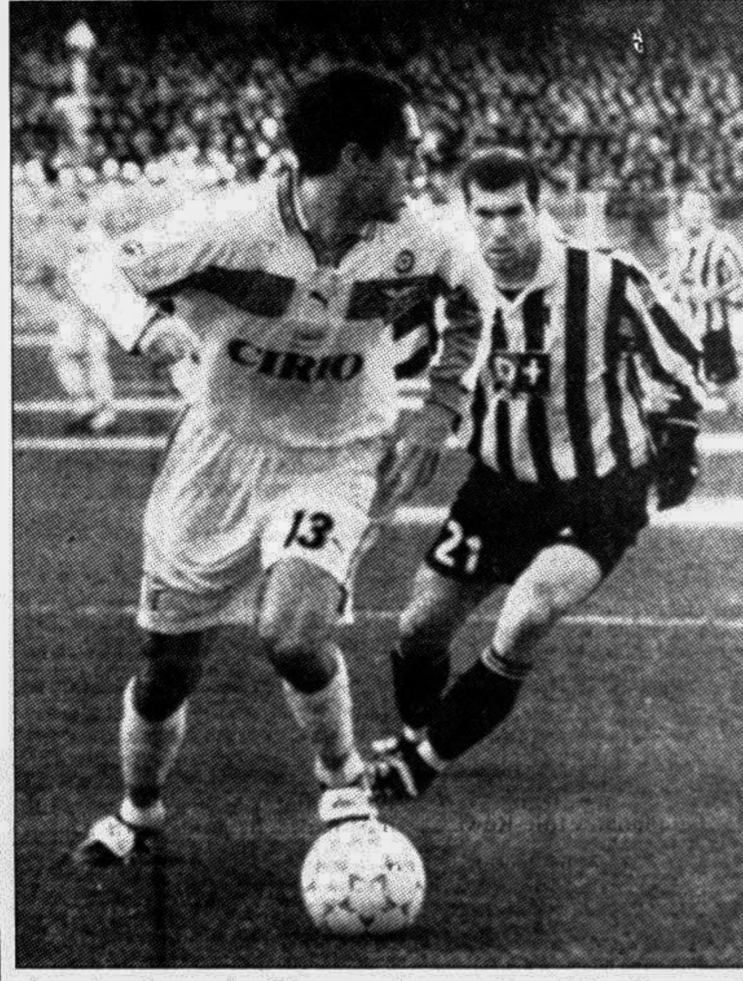
Lazio's Alessandro Nesta is being followed by Juventus' French playmaker Zinedine Zidane. The Roman club defeated its Turin hosts 1-0.

Wilstermann would have won the title automatically if they had finished top of the second stage as well.