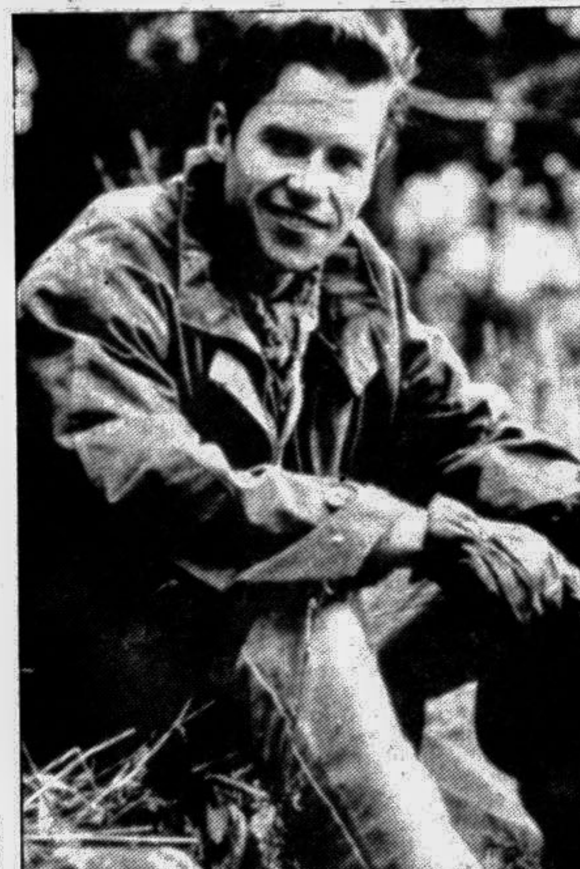
Snowy River: The McGreggor Saga on Star Plus Montana's Territory at 9:30 today

6:30 Nainad 7:30 Good Morning India 9:15 The Trial Show 9:30 Snowy River: McGreggor Saga 10:30 Santa Barbara 11:30 The Bold And The Beautiful 12:00 Janata Ki Adalat 12:30 Living on the Edge 1:00 Baked