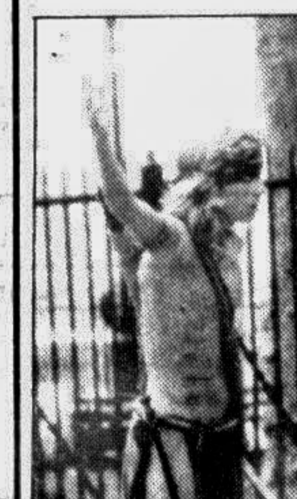
Comedy on Star Movies Jungle 2 Jungle at 12:15 midnight

America's highest paid sitcom star, Tim Allen, stars in this delightful family comedy as a man who winds up with much more than he bargained for after a trip to Africa. Also starring Jobeth Williams, Lolita Davidovitch and Martin Short.