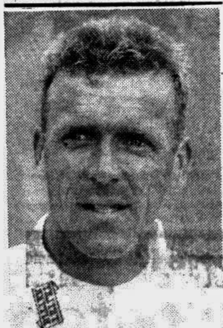
Alec Stewart (England Test captain)

To spend time out in the middle was the most important thing for me. After scoring a hundred against Victoria