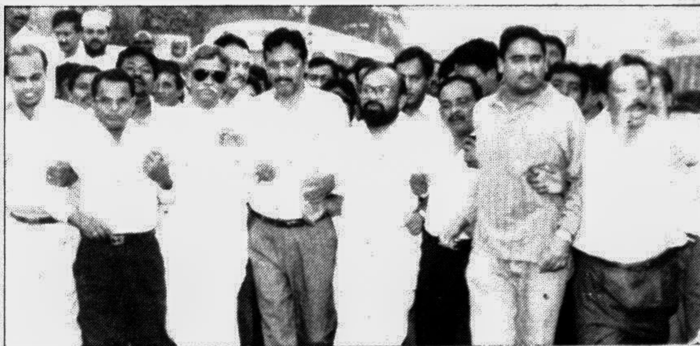
BNP brought out a procession in the city yesterday protesting attack on its leaders and workers allegedly by AL activists during election campaign in Pabna-2 constituency on Saturday.

The CEC sought sincere co-operation of all concerned.