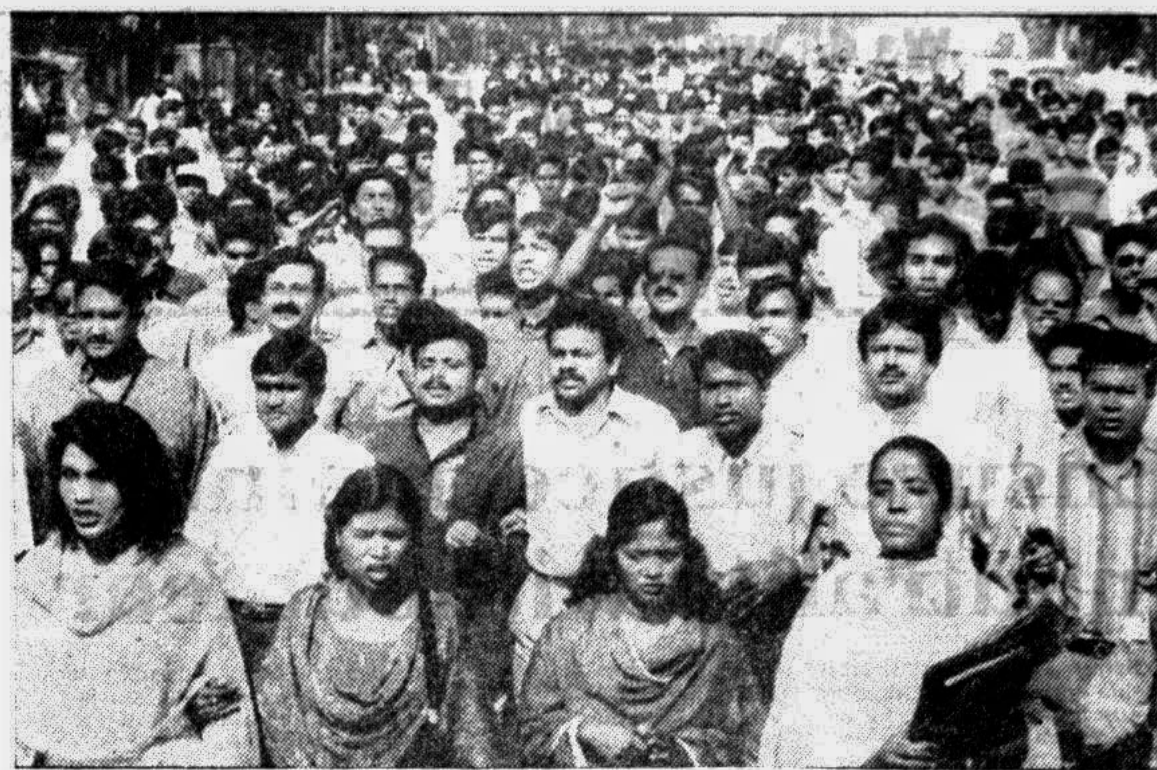
JCD brought out a procession on Dhaka University campus yesterday to mark the Democracy Day.