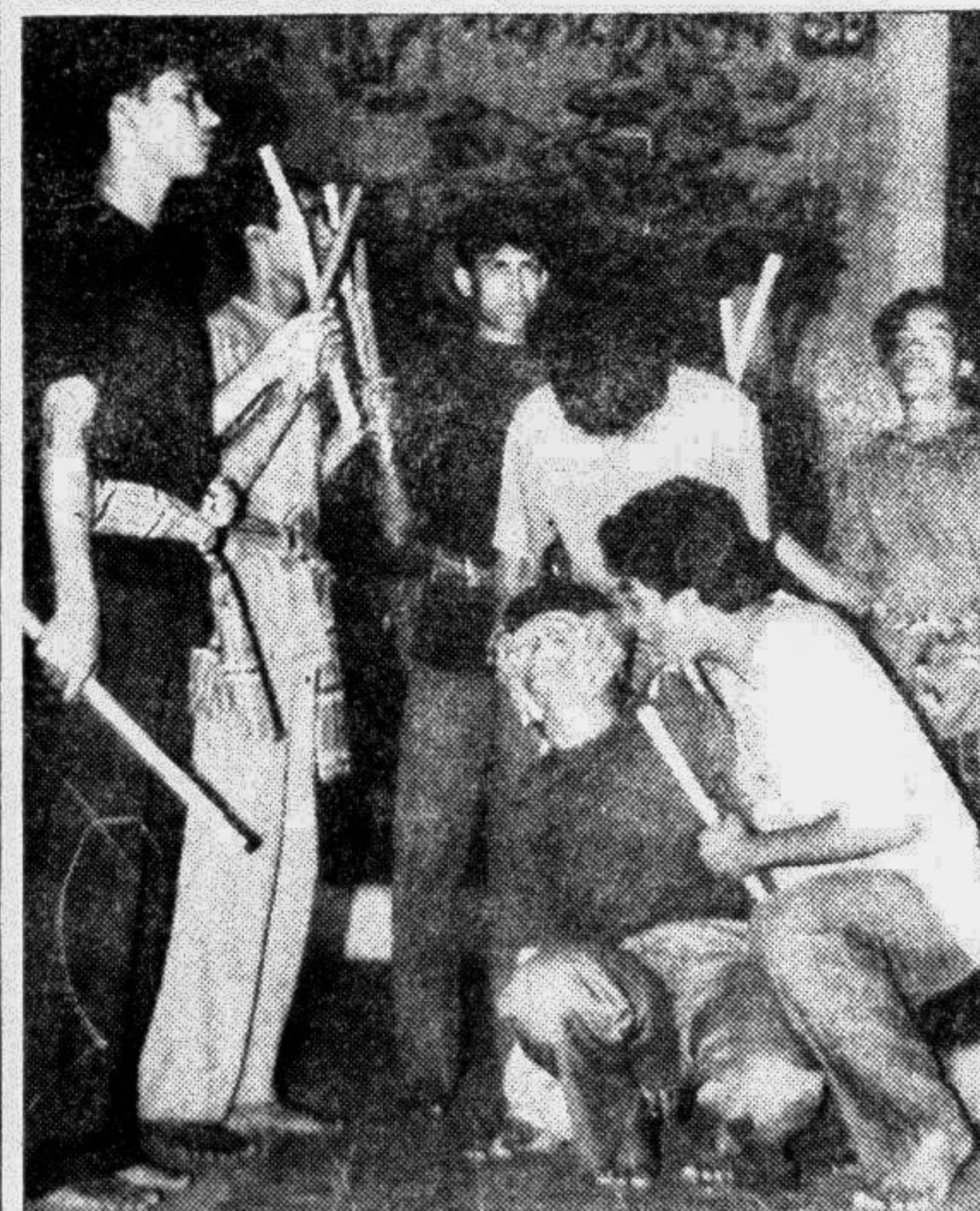
Nandan Natya Goshthi staged 'Lathi' at the Street Drama Festival yesterday.