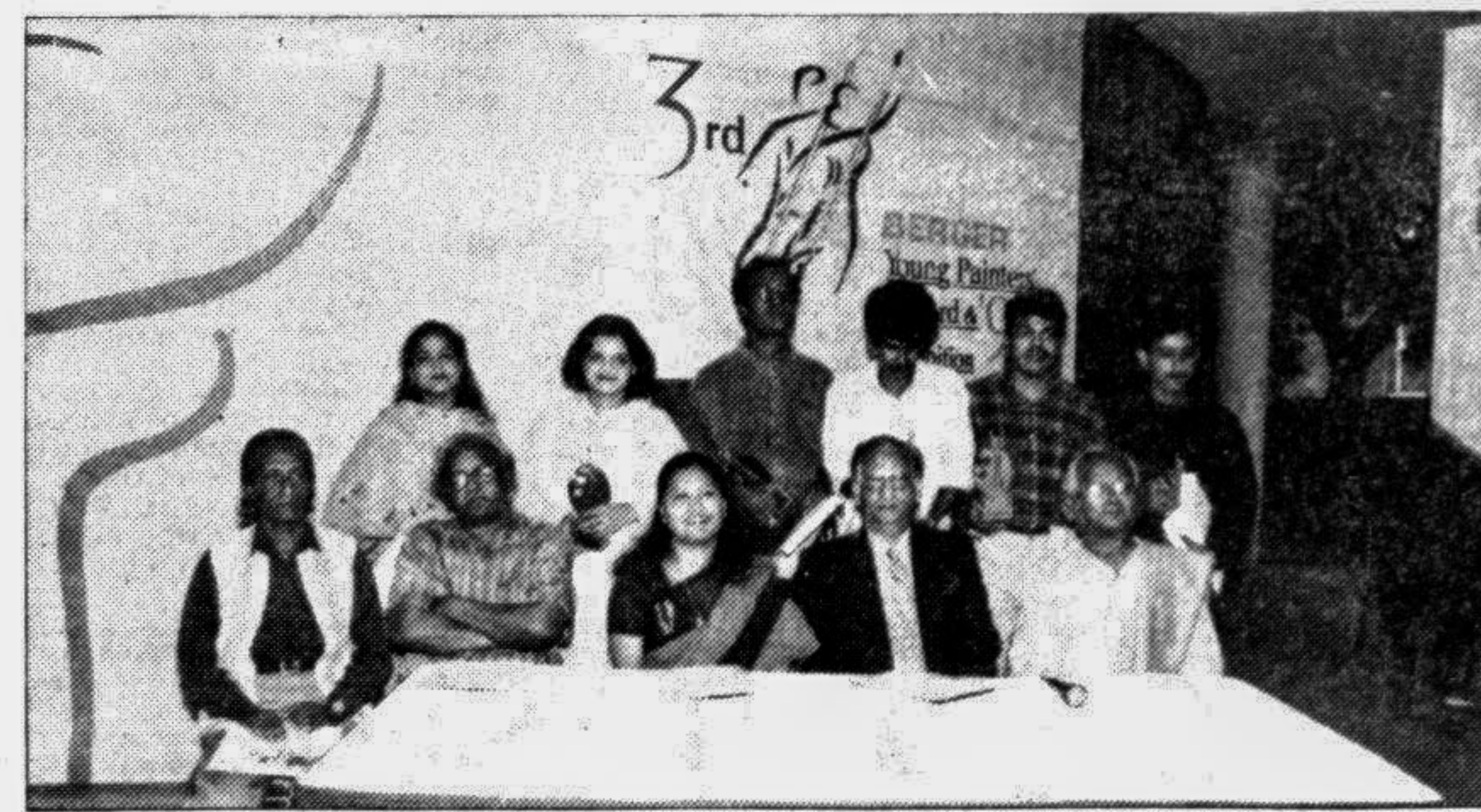
The third Berger Young Painters' Award giving ceremony was held at the Institute of Fine Art yesterday. The winners are seen in the picture.

The programme will start at 4-30 pm at the school premises.