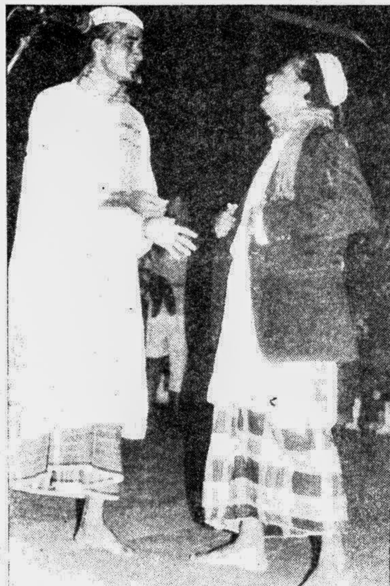
A scene from the play 'Putul' staged by Udichi of Gazipur at the Central Shaheed Minar yesterday as part of the ongoing Street Drama Festival.