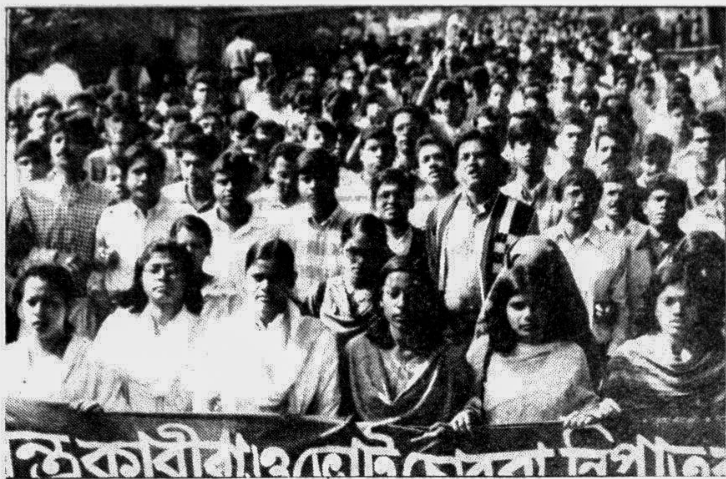
A BCL procession on Dhaka University campus yesterday in protest against violence in Pabna-2 constituency.