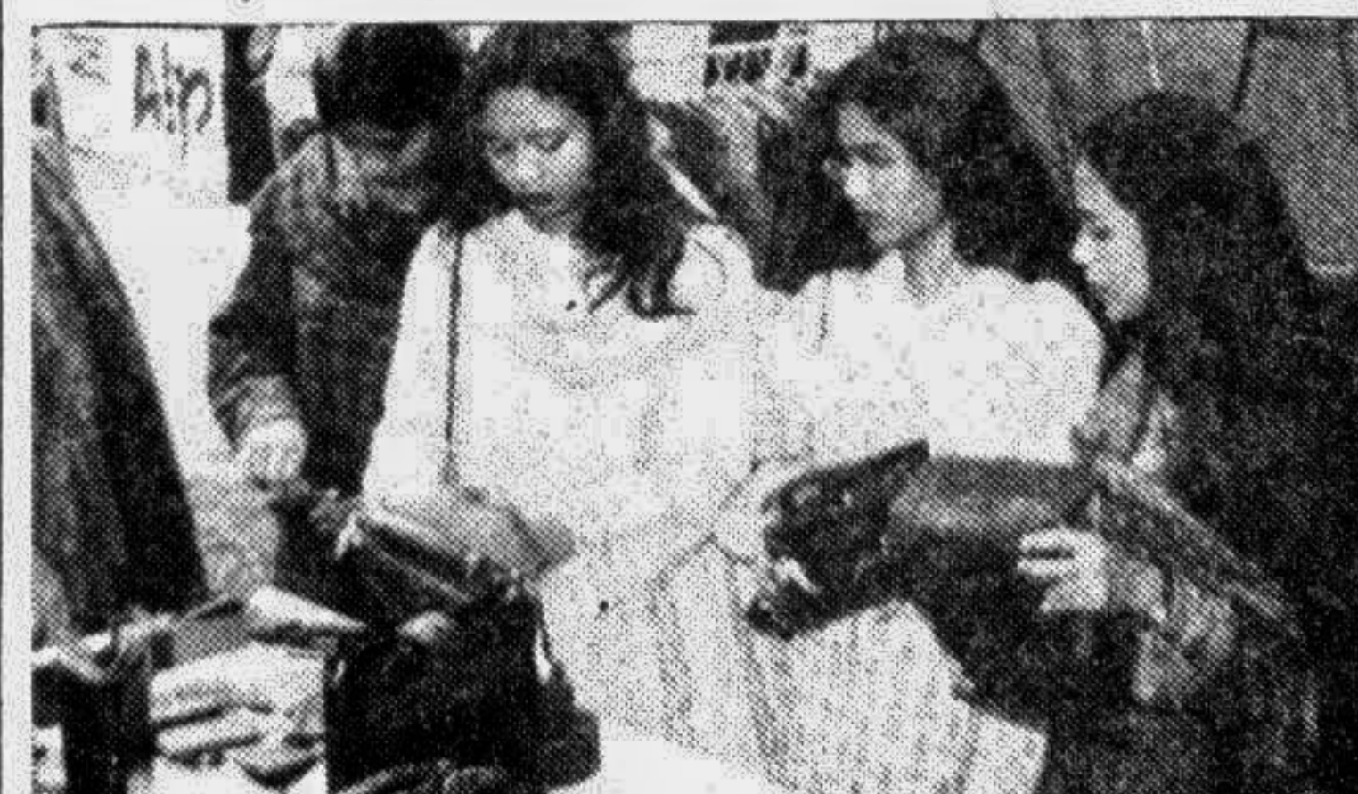
Visitors on the last day of the Ananda Mela at the Officers' Club yesterday.