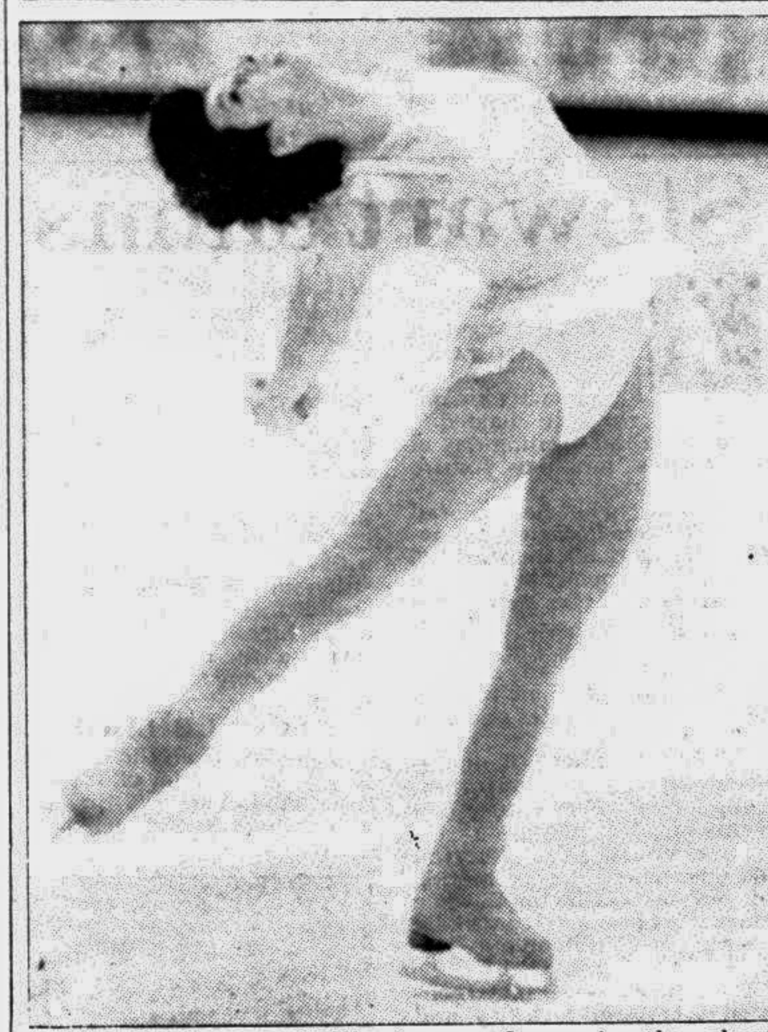
Elena Liashchenko of Ukraine performs in the short programme at the NHK Figure Skating Championship in Sapporo, Japan on Friday.

BAGOC's apologia for anthem chaos BANGKOK, Dec 5: Asian Games organisers apologised Saturday for playing a wrong national anthem at a preliminary soccer match but warned a similar mistake could occur again, reports AP. The Saudi Arabian anthem was played instead of the anthem of the United Arab Emirates before the UAE's match against North Korea last week. The Bangkok Asian Games Organising Committee (BAGOC) spokeswoman Valerie McKenzie said apologies had been made, but the incident showed urgent action was needed by team officials to prevent a repeat.