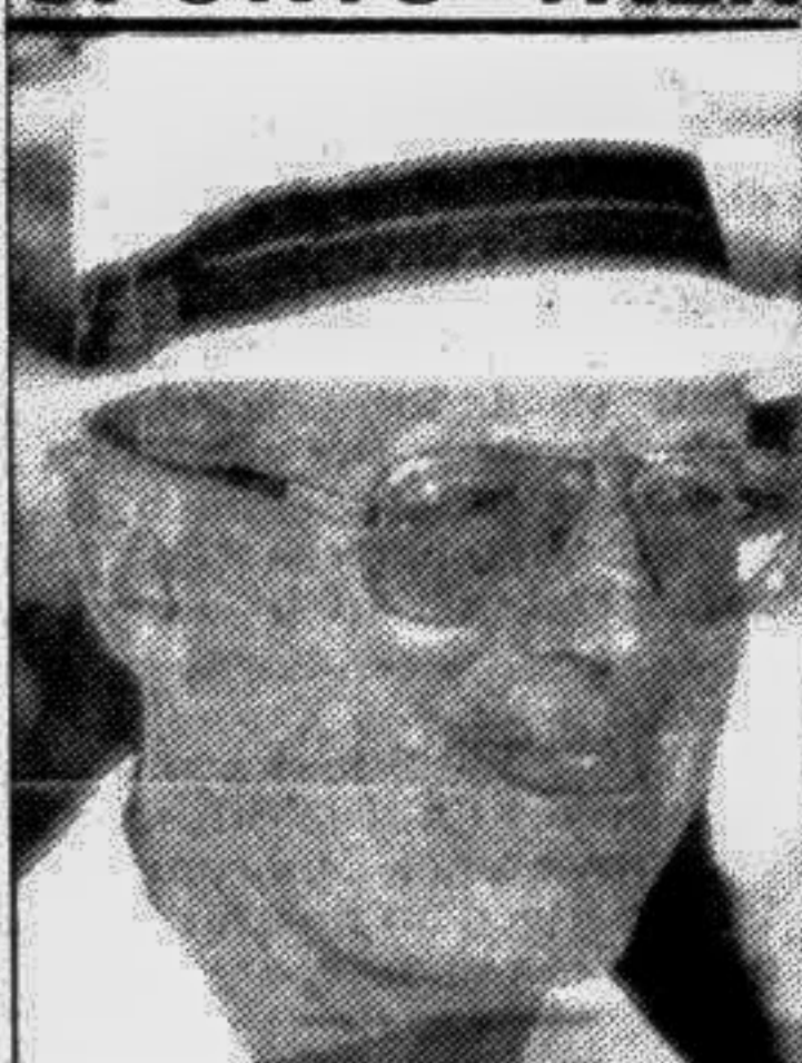
Geoffrey Boycott (Popular cricket commentator)

"Selectors! Don't you hate 'em? For years I worry about the mentality of any English team-pickup who can leave out the three-stars-in-one-body playing under the name of Chris Lewis."