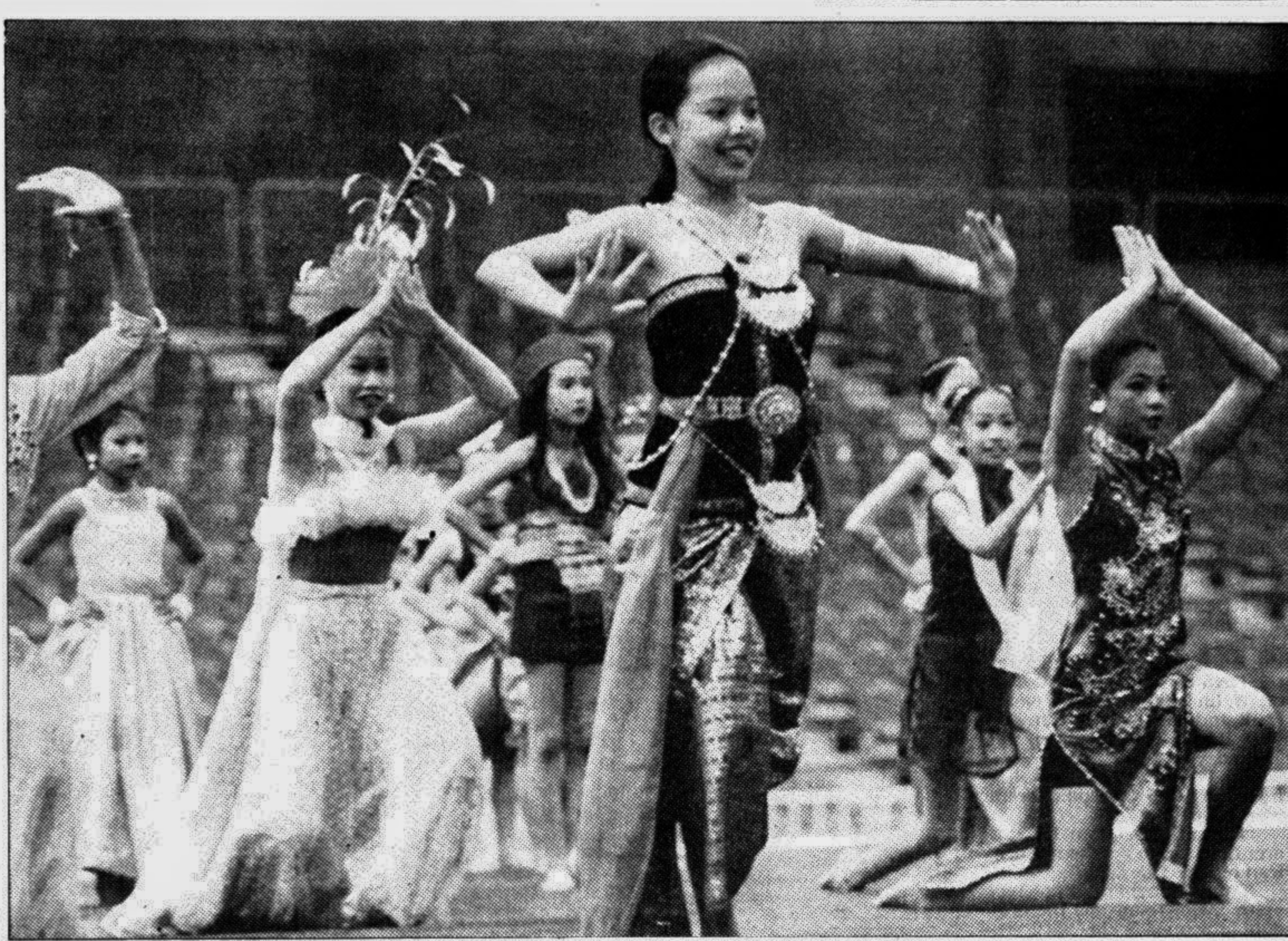
Thai girls taking part in a dress-rehearsal for the Asian Games' opening ceremony in Bangkok yesterday. The Games open today.