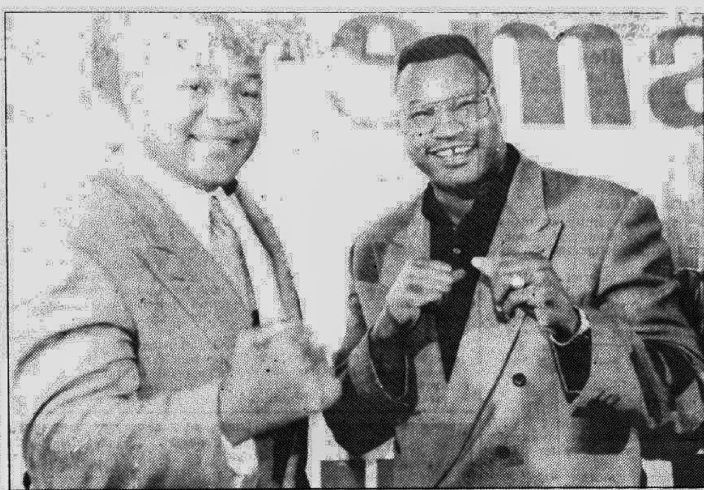
Former heavyweight champions George Foreman (L) and Larry Holmes pose during a press conference in Beverly Hills on December 1. The boxers will slug it out in a 'Birthday Bash' bout to celebrate their 50th anniversaries on January 23 in Houston, Texas.