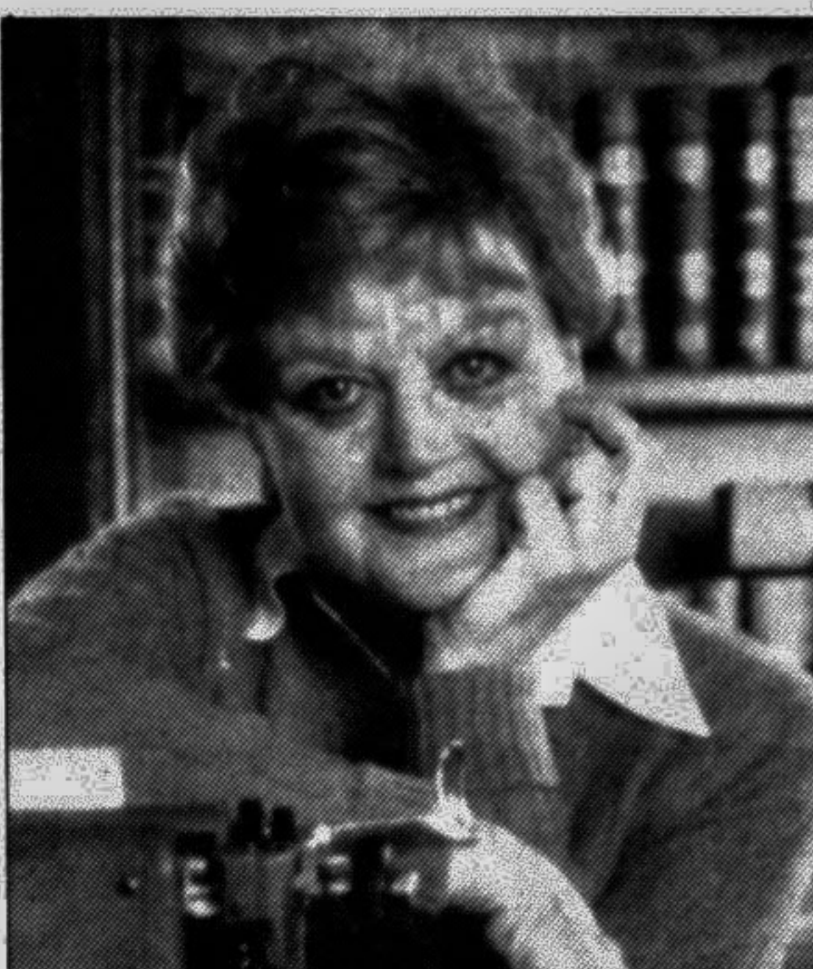
Murder, She Wrote on Star Plus at 1:30 tonight.