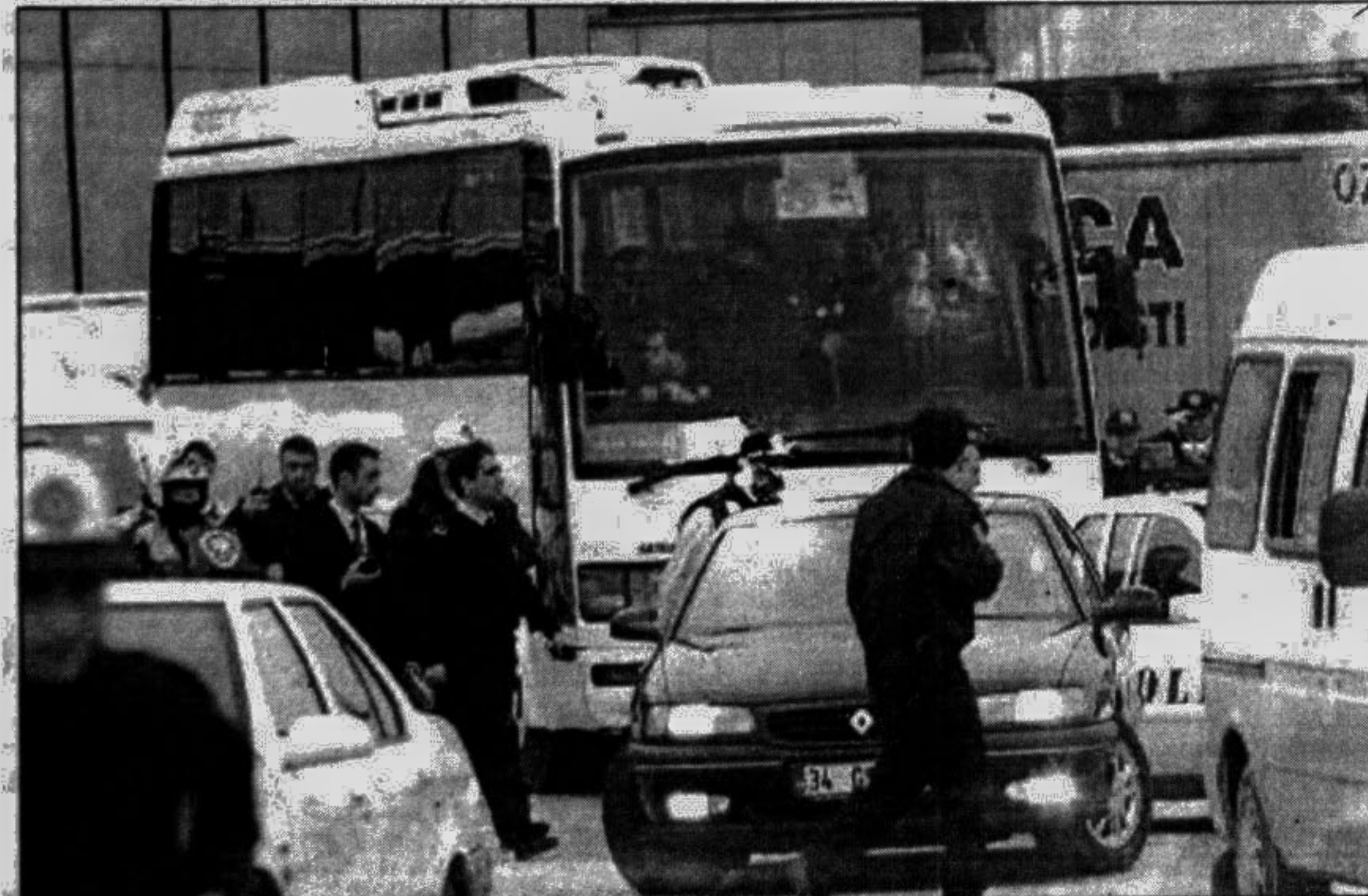
Riot police escort the Juventus team bus to the hotel in Istanbul after the Turin club arrived in the Turkish city yesterday.

The third stop of the 12-meet World Cup series concludes Wednesday night.