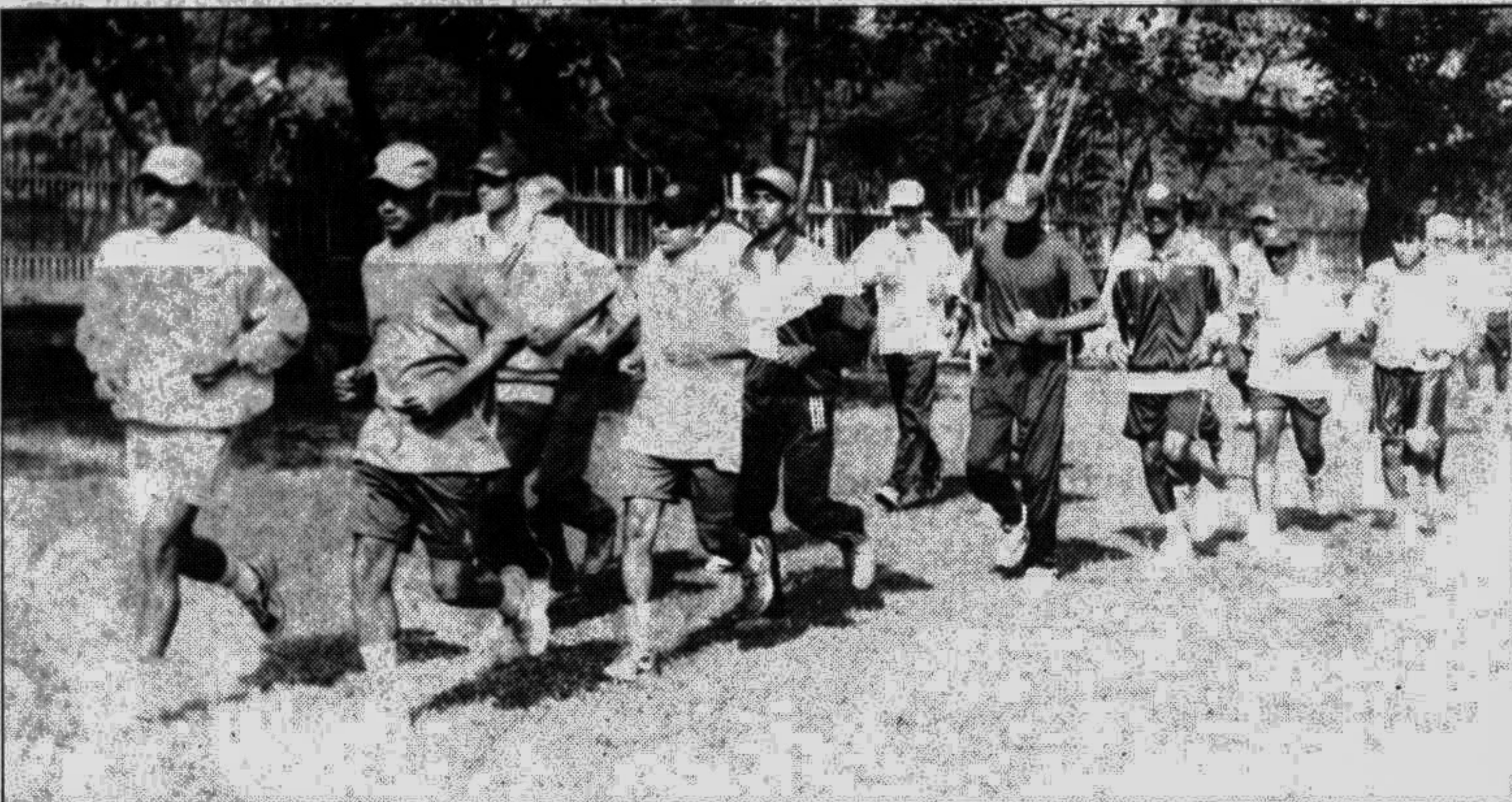
Kalabagan cricketers warming up at their club field in Dhanmondi yesterday morning.

Eleven sports clubs of Rajshahi and district teams from Chapainawabganj, Dinajpur and Pabna will also participate in the 13-day event.